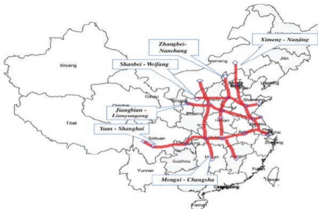
Figure 2. China's National UHV Plan

26