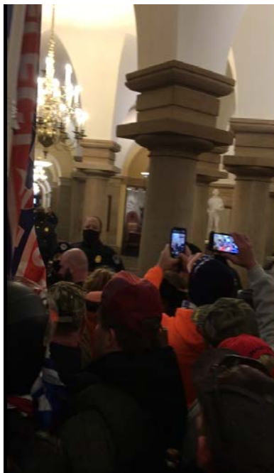
Another photograph from BAUER'S phone depicts the crowd inside the crypt: