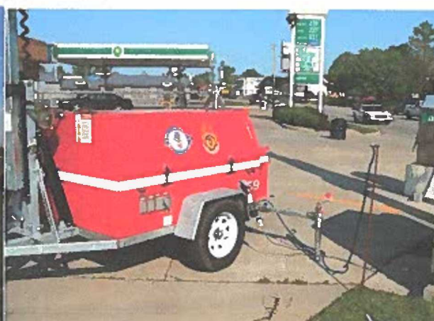
Generator Light Tower Trailers