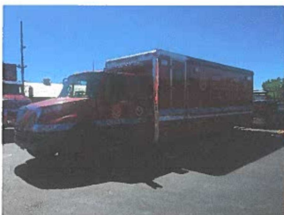
Mobile Emergency Room Vehicle