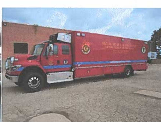
Mobile Morgue Vehicle