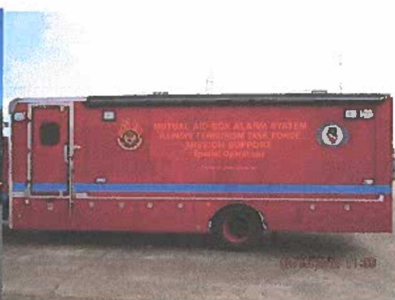
Mission Support Command Vehicles