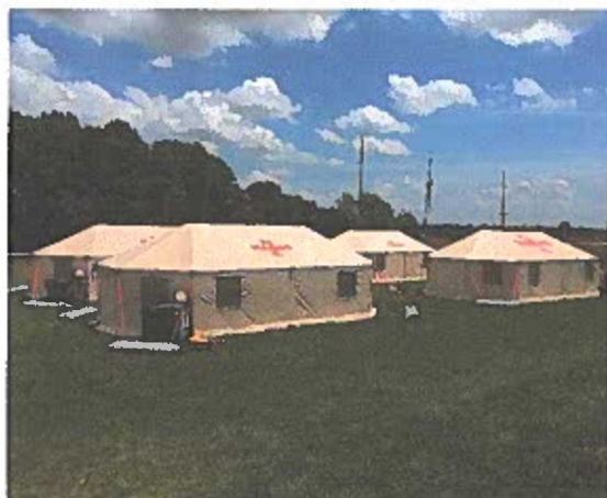
Western Shelter Tent Systems