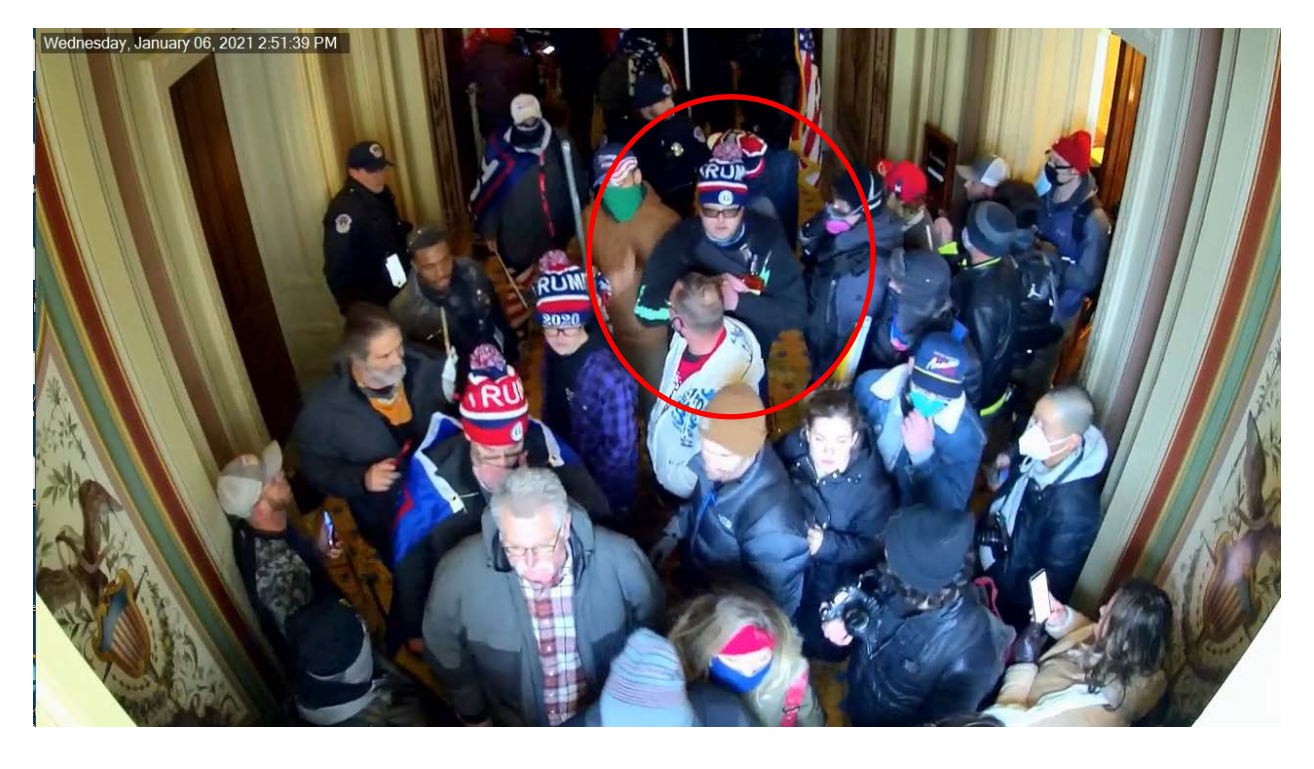
About four minutes after THOMPSON leaves the Capitol building, he returns with LYON: