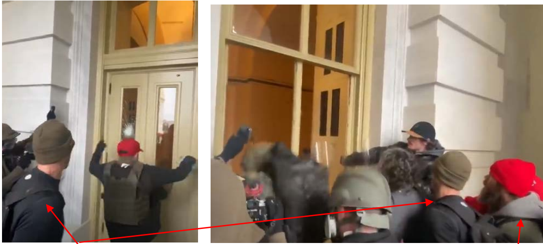
JEROD WADE HUGHES

was broken out of the window frame, JOSHUA CALVIN HUGHES and JEROD WADE HUGHES joined other rioters in climbing through the window into the Capitol.