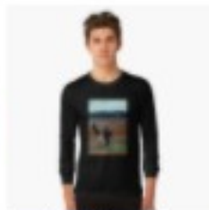
Long Sleeve T-Shirt $26.25