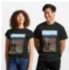
Classic T-Shirt $20.73