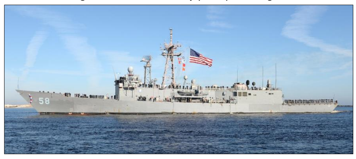
Figure I. Oliver Hazard Perry (FFG-7) Class Frigate