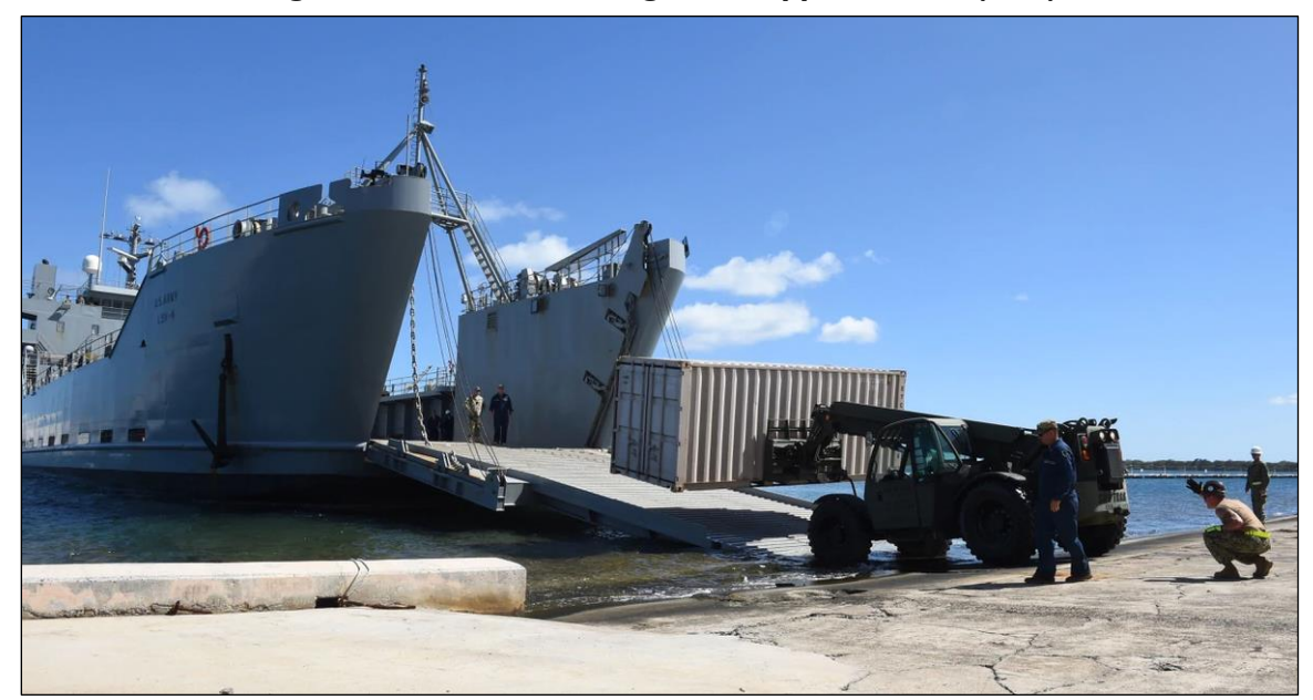
Figure 6. Besson-Class Logistics Support Vessel (LSV)

Another potential issue for Congress is whether at least some portion of the operational requirements for the LAW program could be met cost effectively met by adapting existing U.S. military ships rather than building new LAWs. Some observers, for example, argue that at least some portion of the operational requirements for the LAW program could be met more cost-effectively by transferring existing Army watercraft known as Logistics Support Vessels (LSVs) ( Figure 6 ) to the Navy and adapting these LSVs to the LAW mission.