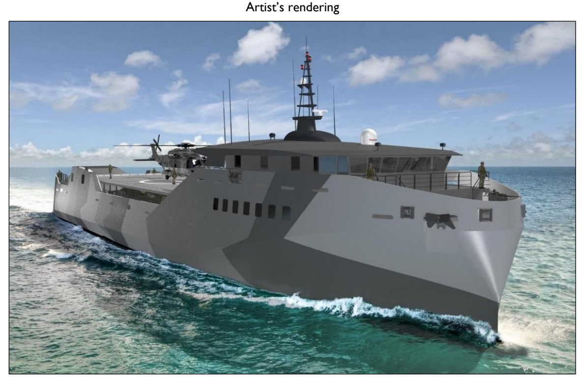
Figure 5. Notional Design for a LAW-Like Ship