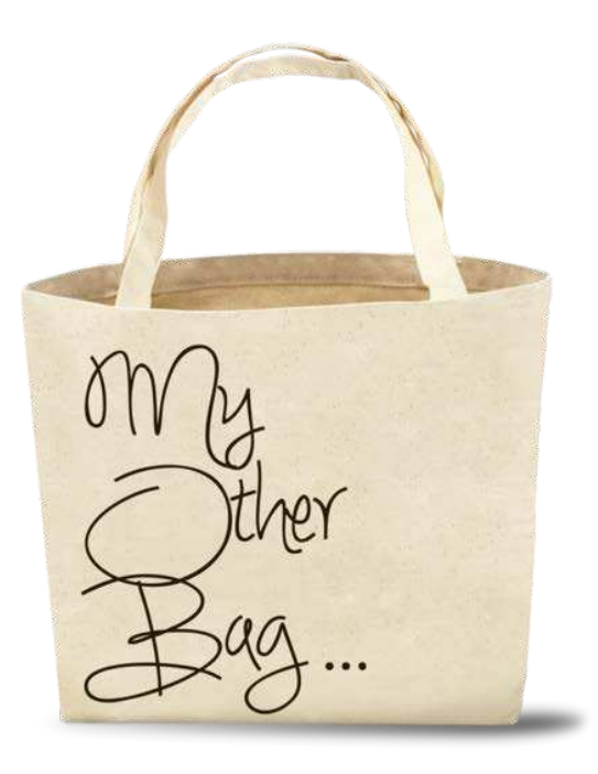
Fig. C. - My Other Bag's Zoey - Tonal Brown Tote (Front)