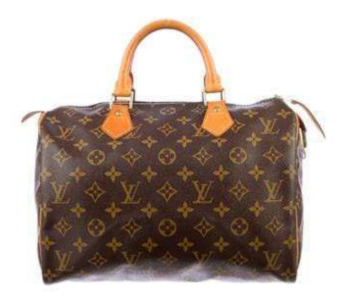
Fig. B. - Louis Vuitton SPEEDY® Toile Monogram