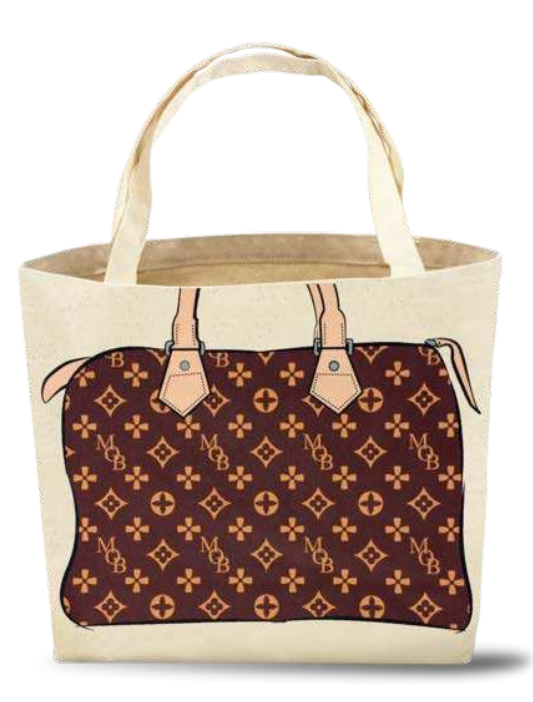
Fig. D – My Other Bag's Zoey – Tonal Brown Tote (Back)