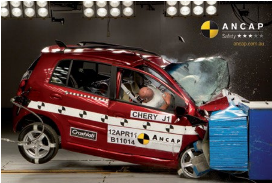
The three-star rated 2011 Chery J1 44

The benefits of safer vehicles on ACT roads are not just confined to drivers and their passengers, with manufacturers designing their vehicles to maximise protection for pedestrians. ANCAP carries out a specific pedestrian test on new cars sold in Australia and New Zealand. The pedestrian tests are carried out to estimate head and leg injuries to pedestrians struck by a vehicle at 40km/h. These crashes represent about 15 per cent of fatal crashes in Australia and New Zealand and can be as high as 30 per cent in urban areas.