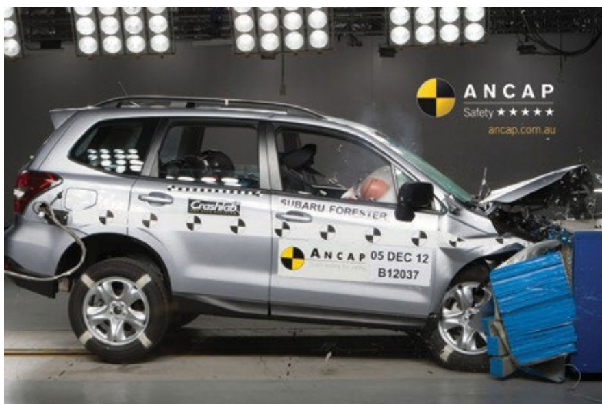
The five-star rated 2013 Subaru Forester 43

ANCAP provides consumers with information on vehicle safety through its safety rating program. ANCAP's primary objective is to inform and educate the public about the level of occupant and pedestrian protection provided by different vehicle models relative to the most common types of crashes.