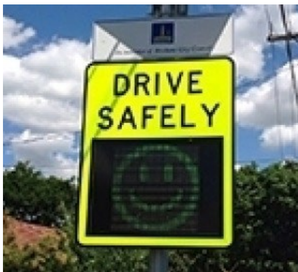
Smiley speeding sign on a Brisbane street.

In Brisbane, speed-detecting signs have been used successfully to slow down drivers on suburban streets. The signs detect motorist's speeds and respond with a 'smiley face' if they are under the speed limit, and a 'slow down' message if they are detected speeding. Data from Brisbane City Council showed nearly 40 per cent of speeding drivers slowed to below the speed limit when they saw the signs.