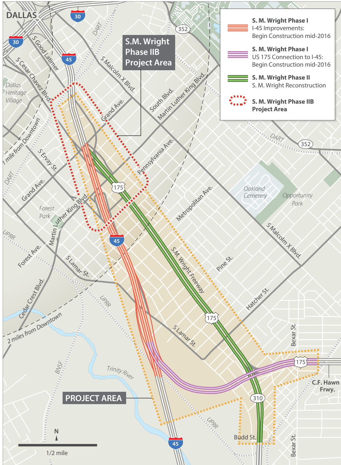
NOTE: Highlighted areas are not drawn to exact scale. TxDOT graphic