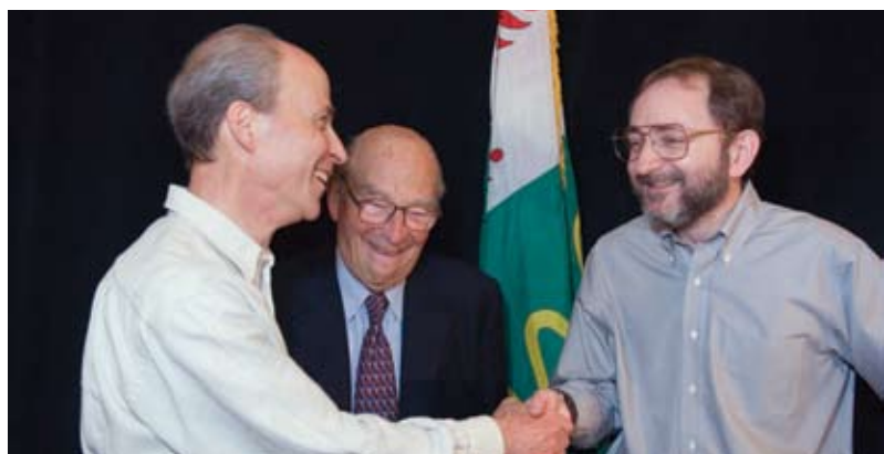
Roger Kornberg (left), the Mrs. George A. Winzer Professor in Medicine, won the 2006 Nobel Prize in chemistry, and Andrew Fire (right), professor of pathology and of genetics, shared the 2006 Nobel Prize in physiology or medicine. With them is Arthur Kornberg, who won the Nobel Prize in 1959.