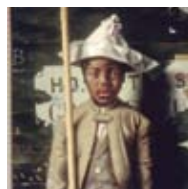
"AMERICAN ABC: CHILDHOOD IN THE 19TH CENTURY" IS DEVELOPED AND DEBUTS AT THE CANTOR ARTS CENTER BEFORE TRAVELING TO WASHINGTON FOR THE REOPENING OF THE SMITHSONIAN'S AMERICAN ART MUSEUM.