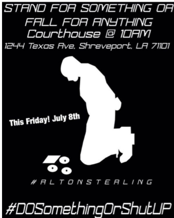
(U) Image from Social Media

!! ATTENTION SHREVEPORT-BOSSIER !! There was a man name Alton Sterling killed in Louisiana, close to where we are. If we don't do something someone we love will get shot next. Let's stand together and fight back. Friday @5 let's start a riot by the courthouse in Shreveport, it don't matter what color you are if you fly us stand by us and fight with us, we stayed nice the whole time now we had enough. Y'all wanted to purge so bad let's give hem one and tear shit down without killing our own black people.