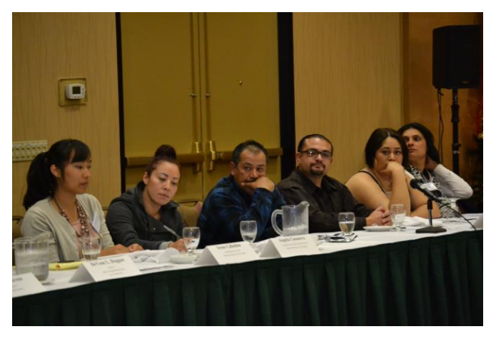
Participants at the Stockton convening consider communitybased violence prevention strategies.