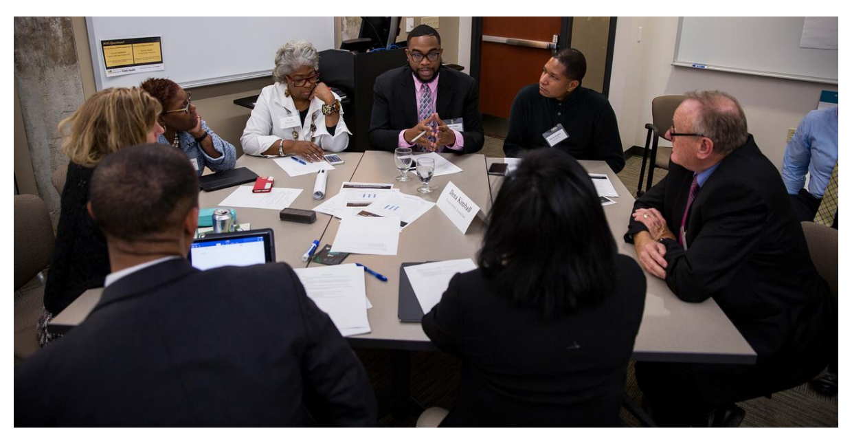
Milwaukee service providers and community leaders brainstorm strategies for preventing firearm violence.

• Use community education to discourage straw purchasing: While participants agreed that straw purchases of weapons are an important source of illegal guns, some expressed concerns about law enforcement—only approaches that deter straw purchasing with the threat of lengthy prison terms. Programs that educate community members about the risks of straw purchasing offer an alternative approach. Research suggests that women may be recruited to serve as straw purchasers (ATF 2000), so programs that reach out to women could be an element in eliminating straw purchasing as a source of crime guns. Operation LIPSTICK (resource 4 in appendix C) is one example of this strategy: the program uses peer-education programs whereby women educate other members of their communities about the dangers of straw purchasing. Operation LIPSTICK also provides follow-up services to help women being pressured into participating in straw purchasing.