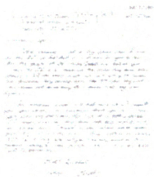
Letter from a private citizen

(U) A recent letter from a constituent in Nevada discusses supporting the IC's position on civil liberties. Click on the images below to read the letter and the DNI's response.