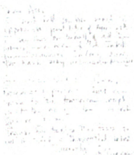
DNI Clapper's response