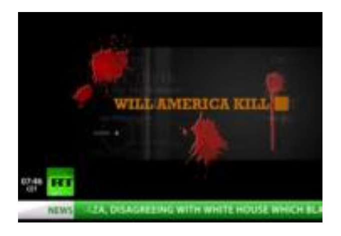
RT new show "Truthseeker" (RT, 11 November)

RT aired a documentary about the Occupy Wall Street movement on 1, 2, and 4 November. RT framed the movement as a fight against "the ruling class" and described the current US political system as corrupt and dominated by corporations. RT advertising for the documentary featured Occupy movement calls to "take back" the government. The documentary claimed that the US system cannot be changed democratically, but only through "revolution." After the 6 November US presidential election, RT aired a documentary called "Cultures of Protest," about active and often violent political resistance (RT, 1-10 November).