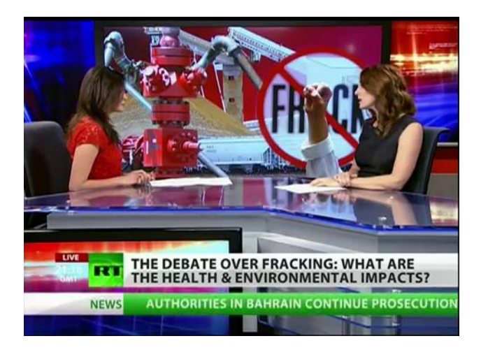
RT anti-fracking reporting (RT, 5 October)

• In an earlier example of RT's messaging in support of the Russian Government, during the Georgia-Russia military conflict the channel accused Georgians of killing civilians and organizing a genocide of the Ossetian people. According to Simonyan, when "the Ministry of Defense was at war with Georgia," RT was "waging an information war against the entire Western world" (Kommersant, 11 July).