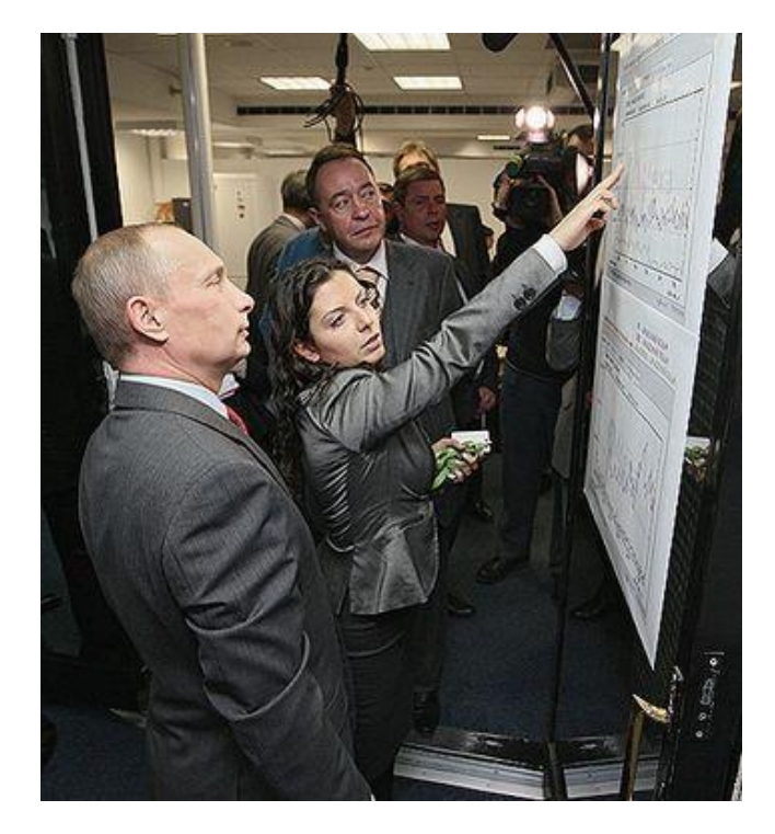
Simonyan shows RT facilities to then Prime Minister Putin. Simonyan was on Putin's 2012 presidential election campaign staff in Moscow (Rospress, 22 September 2010, Ria Novosti, 25 October 2012).

The Kremlin staffs RT and closely supervises RT's coverage, recruiting people who can convey Russian strategic messaging because of their ideological beliefs.