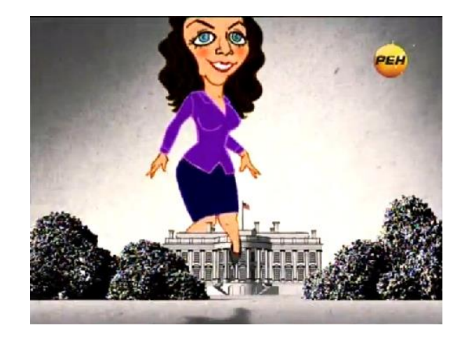
Simonyan steps over the White House in the introduction from her short-lived domestic show on REN TV (REN TV, 26 December 2011)

Wall Street greed, and the US national debt. Some of RT's hosts have compared the United States to Imperial Rome and have predicted that government corruption and "corporate greed" will lead to US financial collapse (RT, 31 October, 4 November).