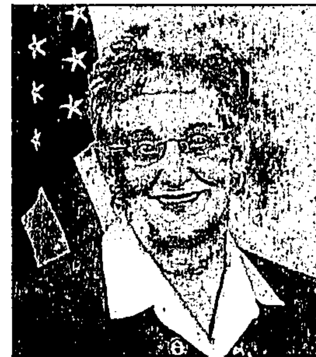
Senator John Barrasso CHAIRMAN