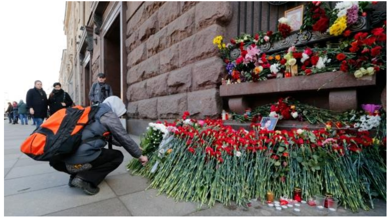
People put flowers outside the Technology Institute subway station in St. Petersburg, Russia, to honour the people killed and hurt there

On Monday afternoon, a bomb went off in a subway station in St. Petersburg, Russia. More than a dozen people died, and many more were injured. This happened while Russia's president, Vladimir Putin, was visiting the city of St. Petersburg. The city's subway system was closed while officials searched other stations for signs of danger, too. The police have said that the bomb was a suicide attack. This means that a person caused a violent incident, knowing they would die in it.