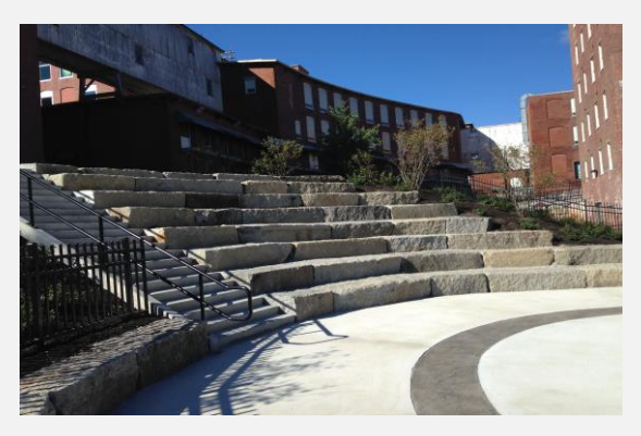
Laconia Plaza - Biddeford RiverWalk