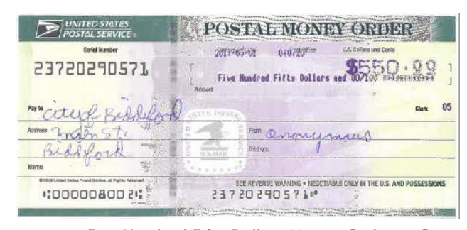
Five Hundred Fifty Dollars Money Order to City Anonymous

The City would like to acknowledge the documents received and thank the individual for coming forward even after all these years!