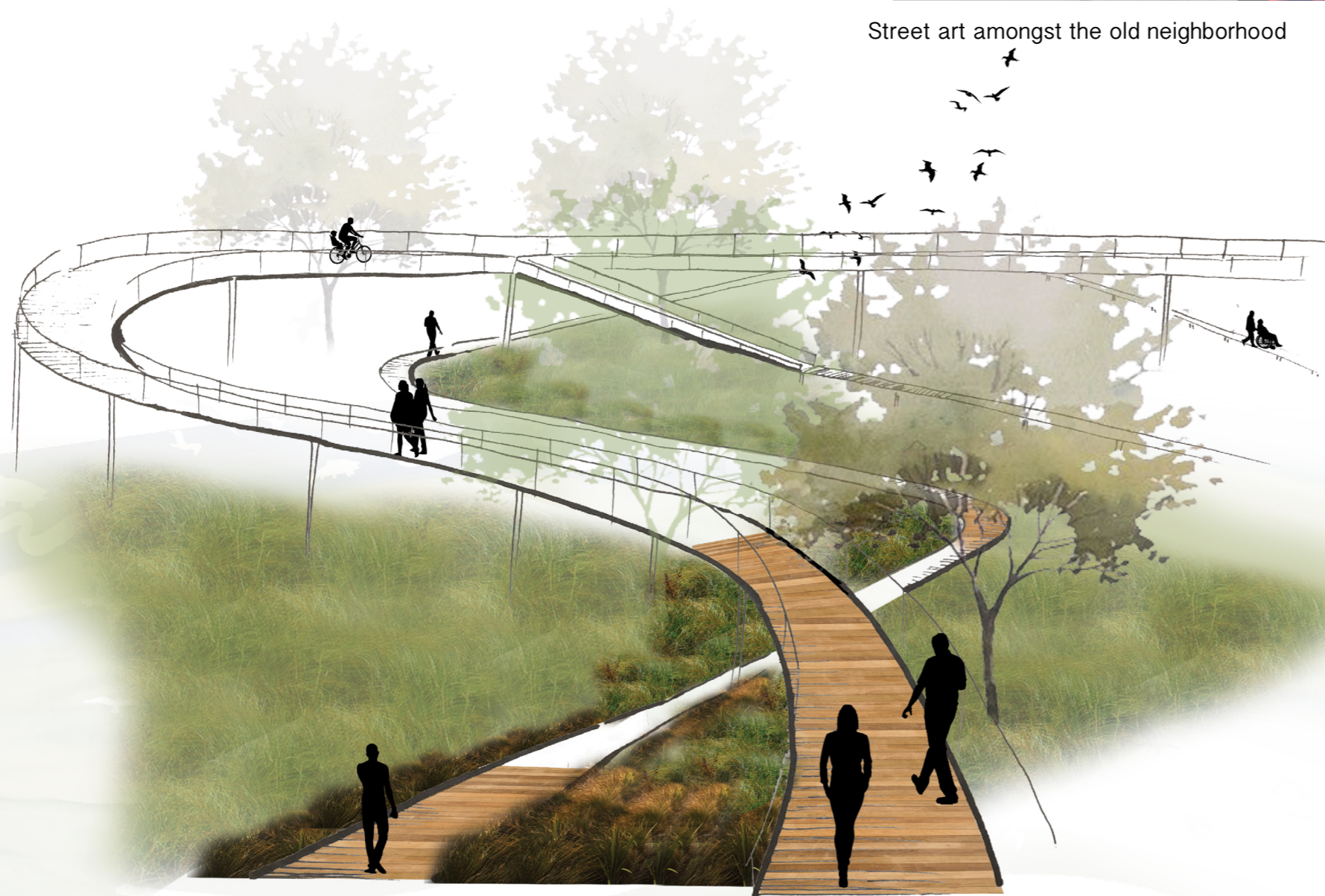
Raised boardwalk with lower boardwalk weaving through the wetland below