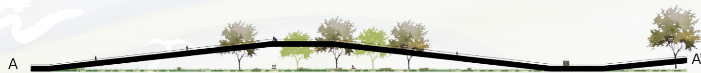
Cross section through the raised boardwalk, showing the different levels Not to scale