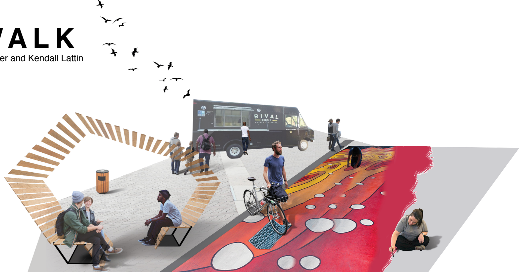
Street art amongst the old neighborhood