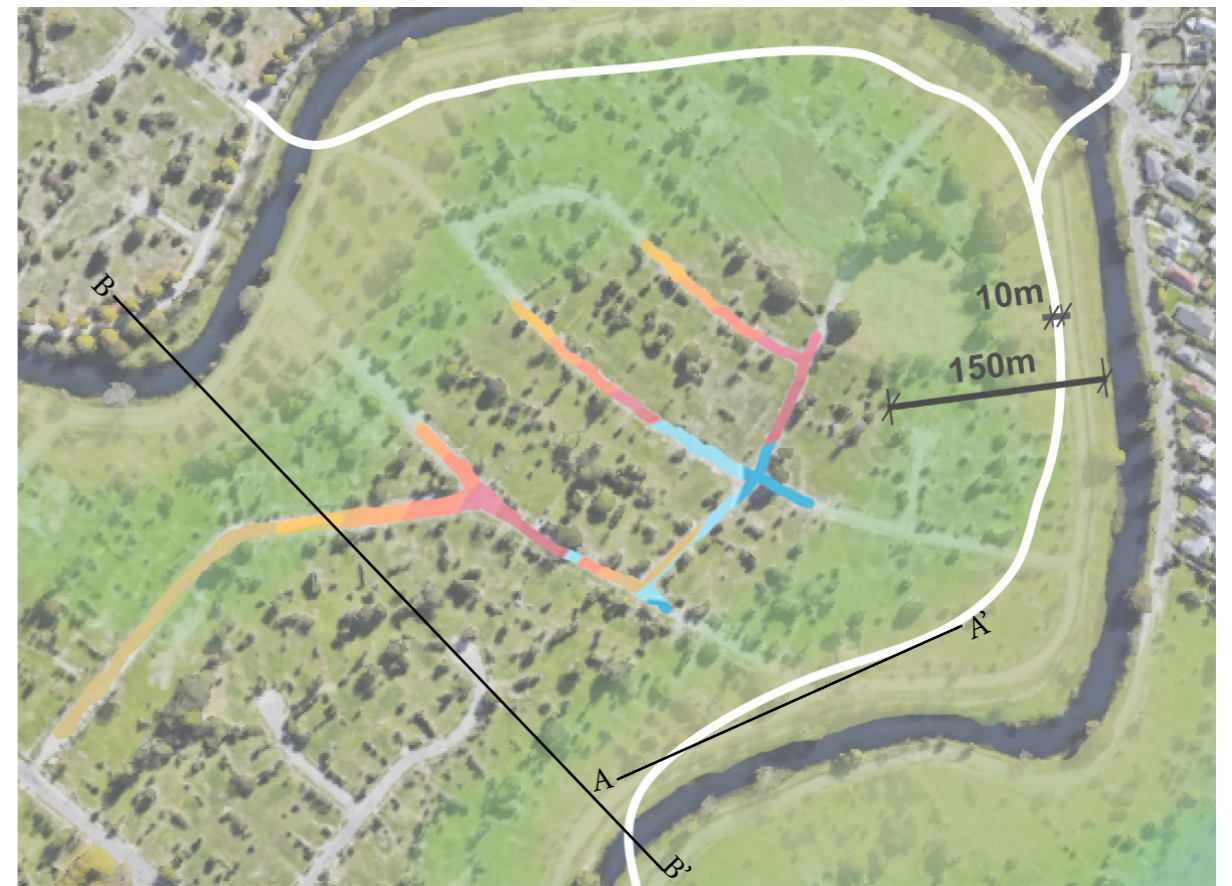
Plan view of street art area