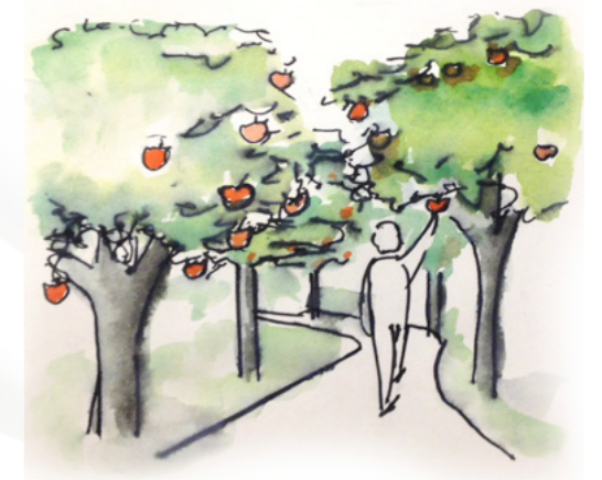
Impressions of potential uses of the Avonside Boardwalk and surrounding areas