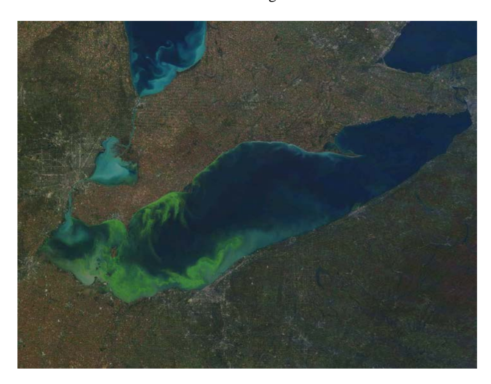
2011 Harmful Algal Bloom