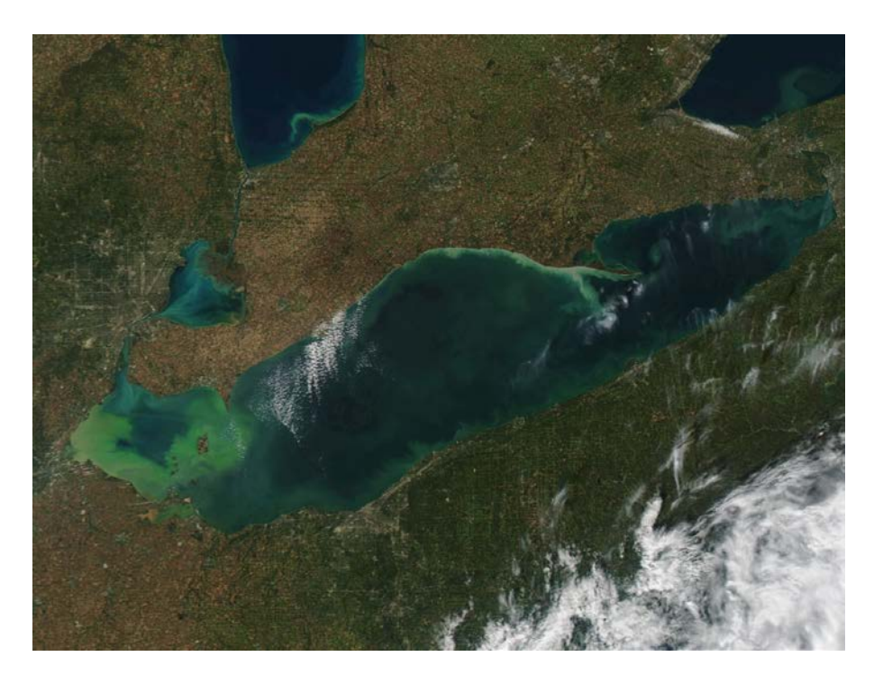
2014 Harmful Algal Bloom