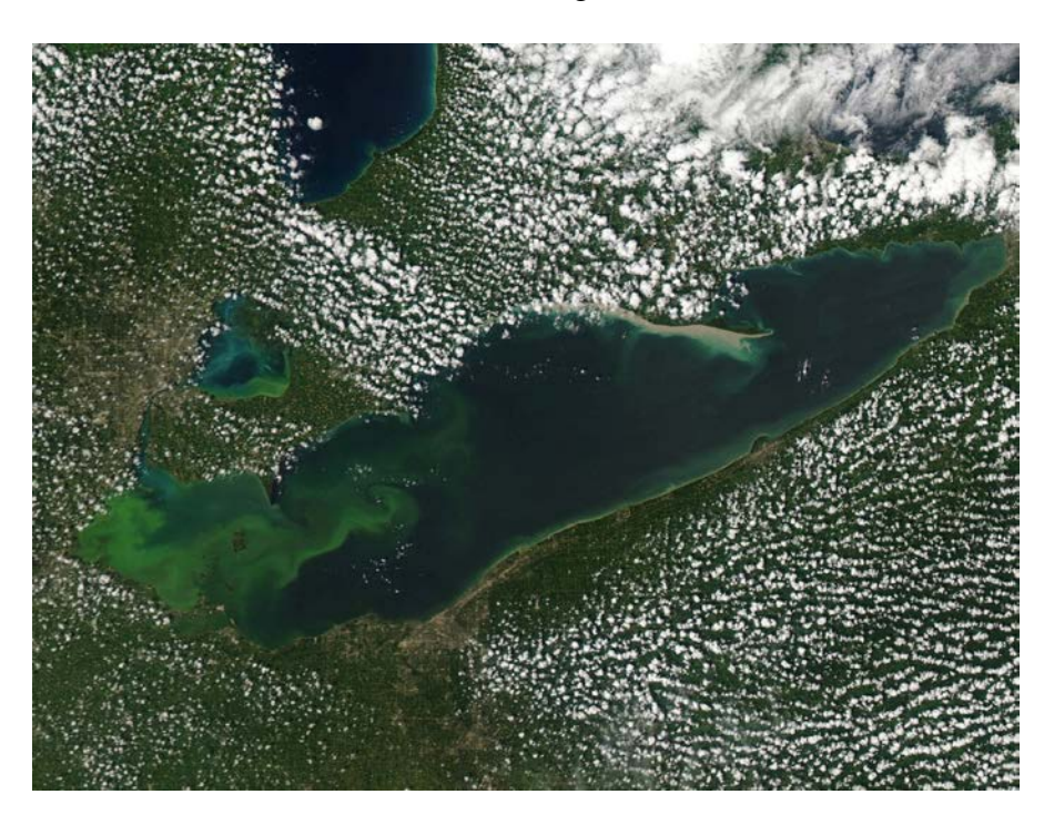
2015 Harmful Algal Bloom