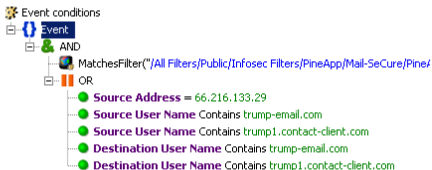
Figure 8: ArcSight Queries for Mail Log