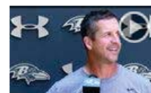
John Harbaugh Not Impressed by 80 Percent Eclipse (00:00:52) Posted 15 hours ago