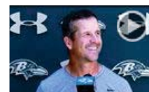
John Harbaugh Glad to Have Todd Heap at Practice (00:06:21) Posted 22 hours ago