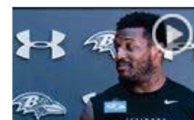
Mike Wallace Says Joe Flacco's Recovery Is 'Top Secret' (00:00:45) Posted 22 hours ago