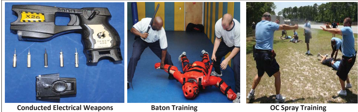
Figure 1: DHS Less-lethal Devices and Techniques