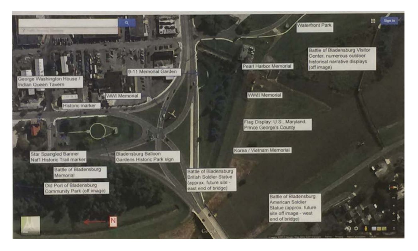
(Supp. J.A. 2)<sup>23</sup>