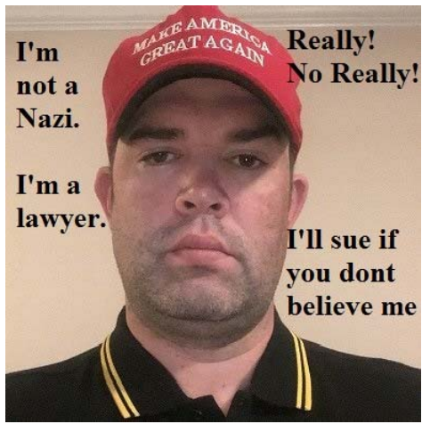
Author: Gerry Bello (/content/gerry-bello)