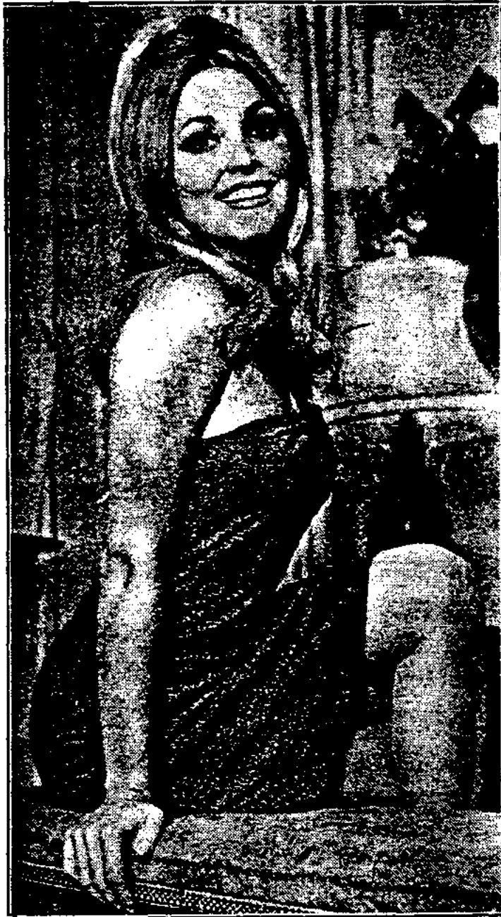
Sharon Tate—police have almost no clues in her death