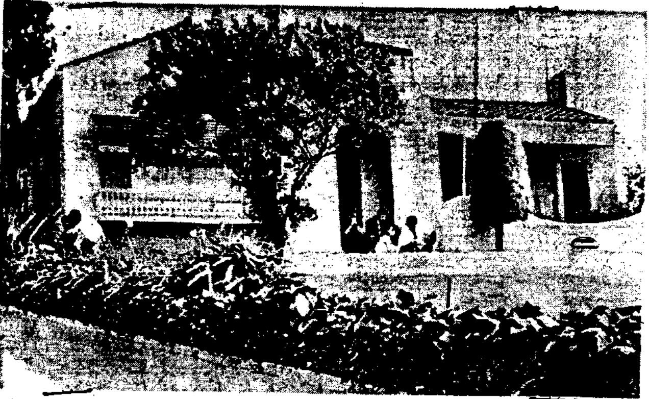
Home of La Blancas, who were slain in somewhat similar fashion to actress Sharon Tate and four others.