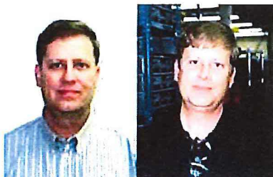
Hall – Minnesota DMV (11/2001)