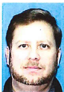
Hall – Passport (2007)