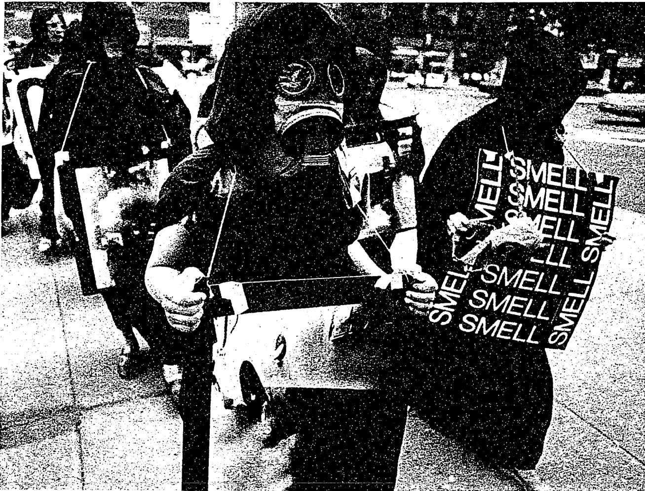
DEMAND —A demonstration in New York. The doctrine of "social responsibility," says the author, would require an executive "to make expenditures on reducing pollution beyond the amount that is in the best interests of his corporation or required by law."

I HAVE, for simplicity, concentrated on the special case of the corporate executive, except only for the brief digression on trade unions. But precisely the same argument applies to the newer phenomenon of calling upon stockholders to require corporations to exercise social respon-