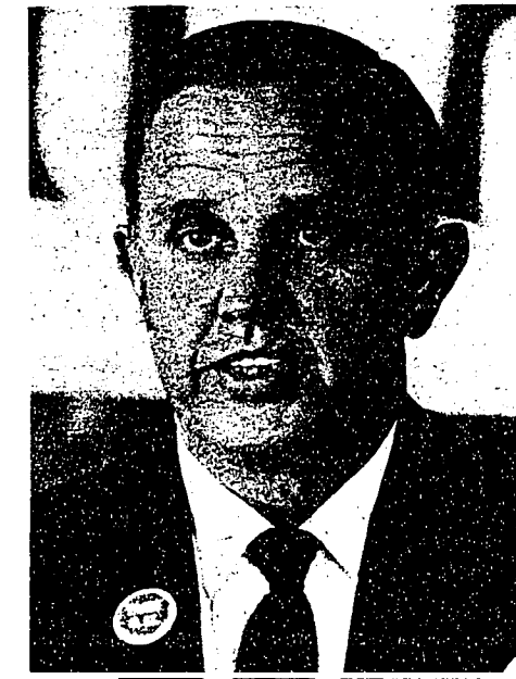
Robert Townsend, the author of "Up the Organization."