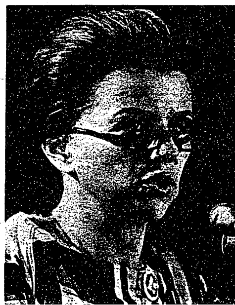
Betty Furness, consumer-affairs adviser in the Johnson Administration.