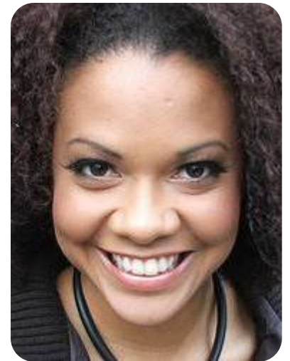
Clean healthy teeth