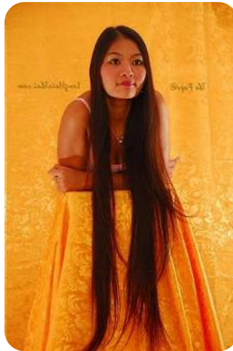
Long shiny hair