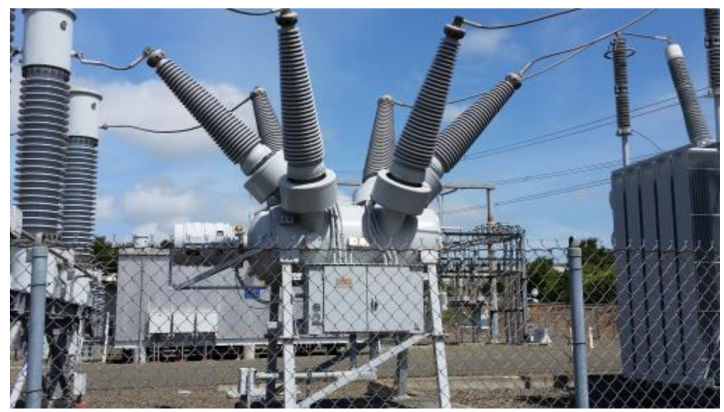
Figure 1: One of Valero Substation's breakers located within PG&E's Bahia Substation