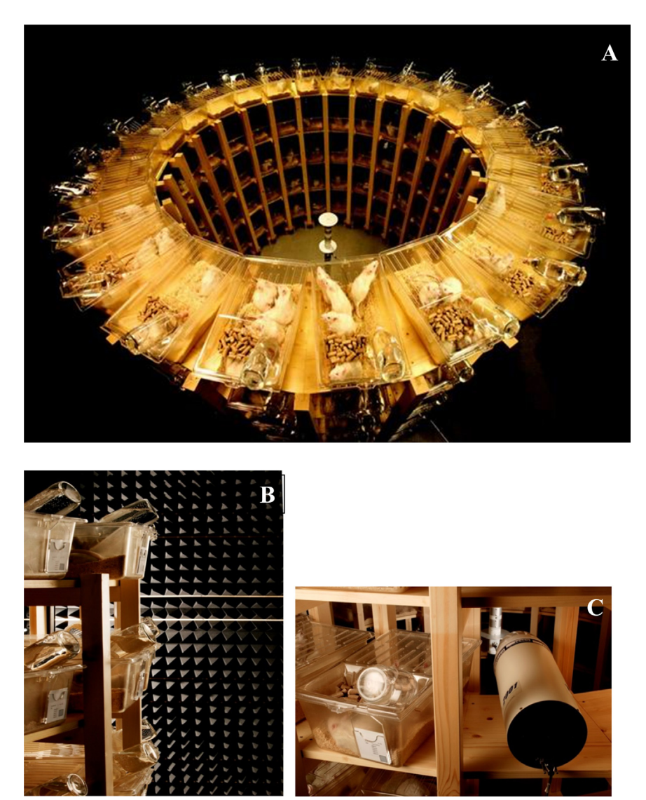
Fig. 1. RI study on 1.8 GHz base station RFR: exposure system. The rat cages were located in wooden circular-shaped devices, as in a sort of condominium. Each single exposure device served at least 400 rats (A). The exposure rooms were totally shielded in order to minimize the effect of field non-uniformity due to reflection and consequent interference caused by the walls (B). Detail of the RFR feedback probe used to measure the field (TESY2001 field sensor) and of the animal cage with methacrylate markers, cover and mangers (C).

produce the following functions: a) generate a GSM signal, with complete channel simulation capability and frequency preselection; b) signal pre – amplifications – age, with gain regulation input; c) final stage, dimensioned for a total power output of plus 50 dBm; d) reference signal loop back input, for closed loops power control; the control was closed at the antenna connection level in order to stabilize at the maximum level the radiation unit RF feed; e) power supply unit; f) cooling unit for continuous use of the device.