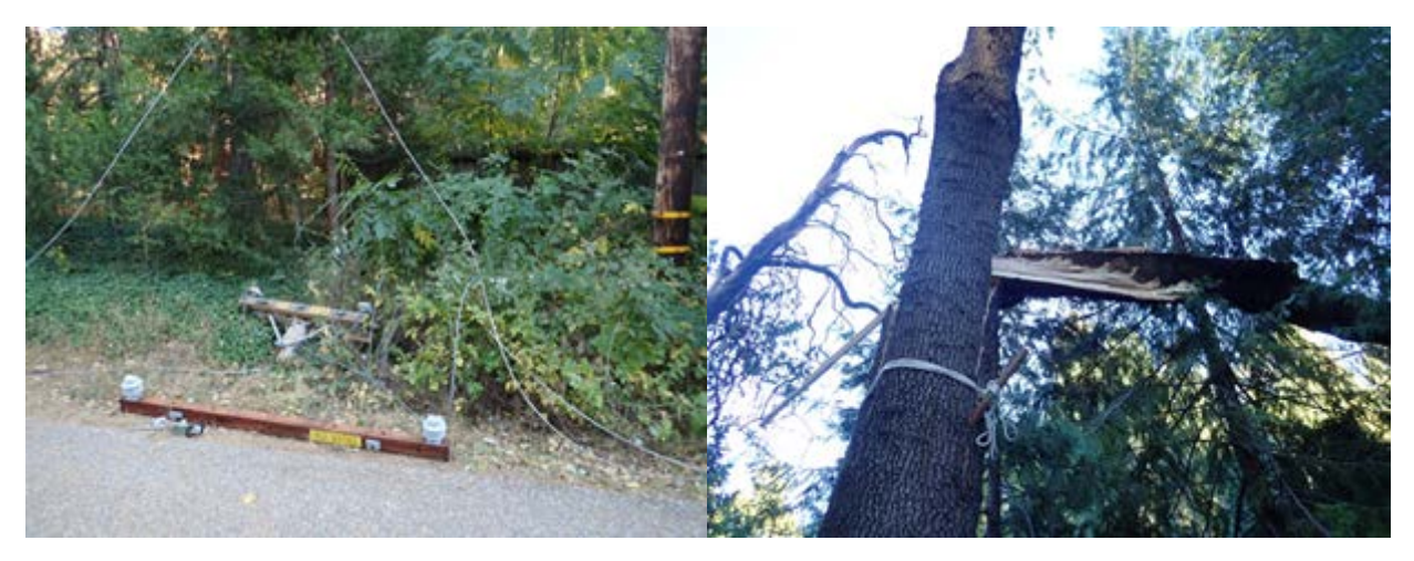
Figure 1. Foresthill, Placer County. Pole, cross-arm and conductor damaged by split tree.