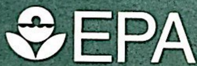
IMPACT OF EPA GREEN PROGRAMS ON U.S. GREENHOUSE GAS EMISSIONS

Other green programs include "Energy Star Computers," which uses an Energy Star logo to help consumers identify energy-efficient desktop computers; "Green Buildings," which encourages the purchase of more efficient heating, ventilation and air conditioning systems for buildings; and the "Golden Carrot," program, through which utilities are offering $30 million in rebate incentives to the refrigerator manufacturer that can build the largest number of the most efficient, chlorofluorocarbon-free refrigerators at the lowest cost. ●