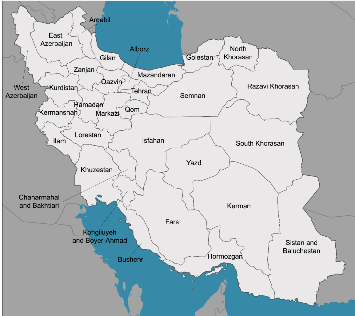
Figure 2. Map of Iran