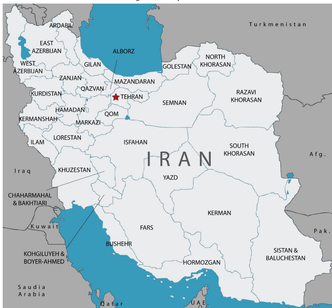
Figure 2. Map of Iran

Source: Map boundaries from Wikimedia Commons, 2007. Graphic: CRS.