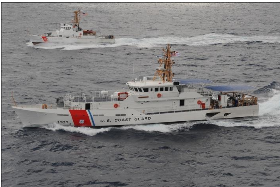
Figure 5. Fast Response Cutter With an older Island-class patrol boat behind