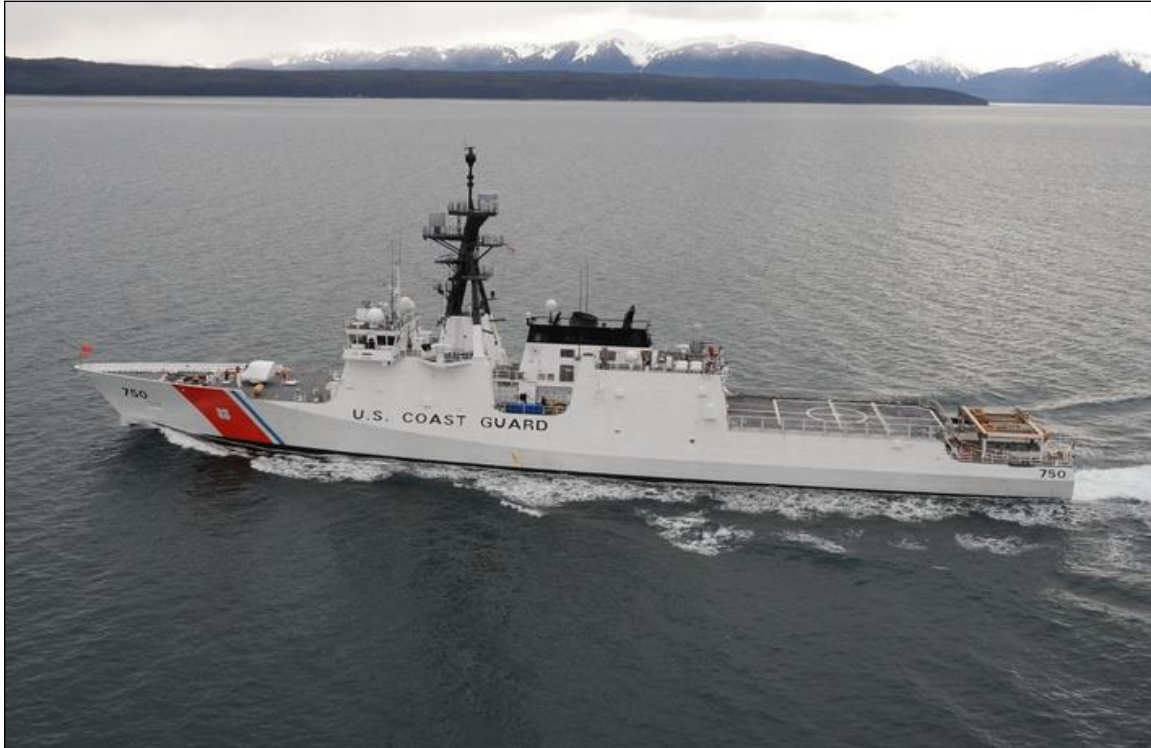
Figure 1. National Security Cutter