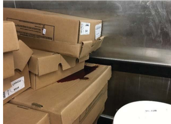
Figure 1. Refrigerator with blood leaking from open boxes containing raw chicken. Observed by the Office of Inspector General (OIG) at the Essex Facility on July 24, 2018.

Detainees also reported being repeatedly served meat that smelled and tasted bad. During dinner service, we observed facility staff serving detainees hamburgers that were foul smelling and unrecognizable (see figure 2).