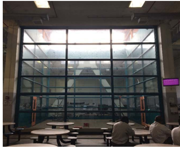
Figure 7. Mesh cages added to glass enclosure inside housing areas to provide “outdoor” recreation for detainees. Observed by OIG at the Essex Facility on July 24, 2018.