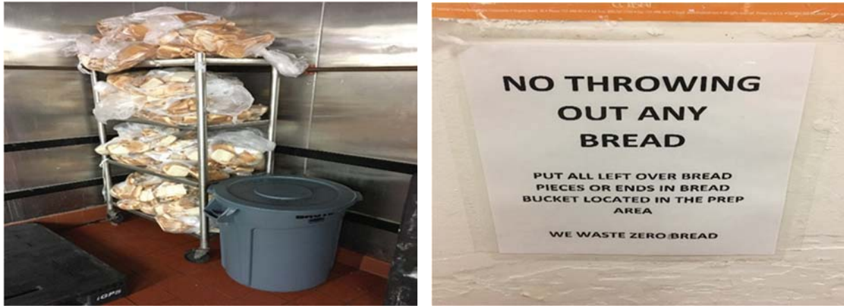
Figure 3. Undated moldy bread held in the refrigeration unit for indefinite periods. Signage posted in the kitchen to direct staff not to discard any bread. Observed by OIG at the Essex Facility on July 24, 2018.

can cause allergic reactions and respiratory problems, and some molds, in the right conditions, can produce poisonous substances that can cause illnesses.