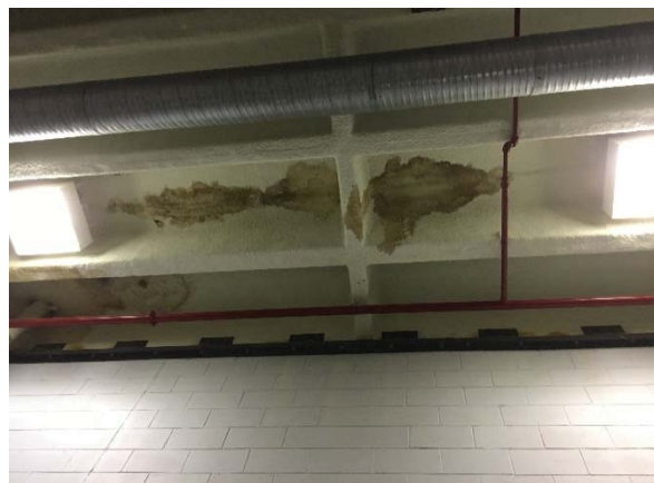
Figure 4. Roof leaks found in every housing unit.

Observed by OIG at the Essex Facility on July 24, 2018.