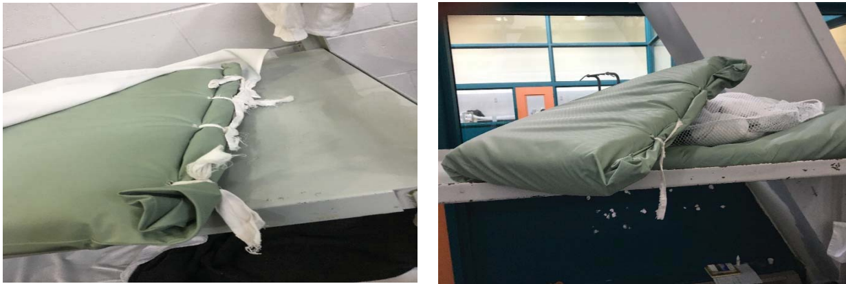
Figure 6. Detainee mattresses being held together with tied sheets. Observed by OIG at the Essex Facility on July 24, 2018.

ICE standards 10 require that all detainees be allowed outdoor recreation time outside their living area. However, the Essex Facility lacks outdoor space, and recreation for detainees was located within housing units. We observed large glass enclosures inside detainee living areas with mesh cages at the top to allow in outside air (see figure 7). Facility staff indicated that ICE was going to build a soccer field for outdoor recreation when the facility began housing detainees in 2010, but ICE never completed the project. ICE records indicate discussions had taken place regarding outdoor recreation, but no agreements were made between ICE and the facility. Based on our review of the contract and ICE inspection records, ICE officials have never documented concerns regarding outdoor recreation in their weekly inspections or cited the facility for failure to meet this detention standard since it began housing detainees.