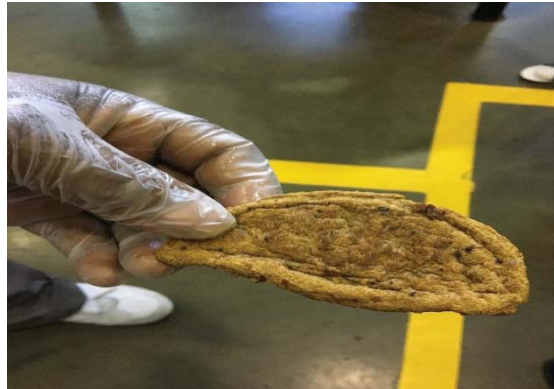
Figure 2. Slimy and discolored lunch meat stored without any labels (at left). Hamburger patty served to detainees that was foul smelling and unrecognizable (at right). Observed by OIG at the Essex Facility on July 24, 2018.

In addition, we observed expired and moldy bread in the facility refrigerator despite U.S. Department of Agriculture guidance 6 to discard bread with mold. Kitchen staff reported placing all unused bread from food service into large trash bags and trash cans to be used for making bread pudding once every 2–3 weeks. Furthermore, kitchen management posted a sign prohibiting the disposal of any bread (see figure 3). According to the U.S. Department of Agriculture, such practices put the health of staff and detainees at risk as mold