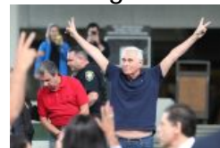
Mueller 'framed' him in Instagram post that could violate gag order

Jackson had slapped that order on Stone on Feb. 21 after he posted on Instagram a photo showing the judge's face next to a rifle scope's