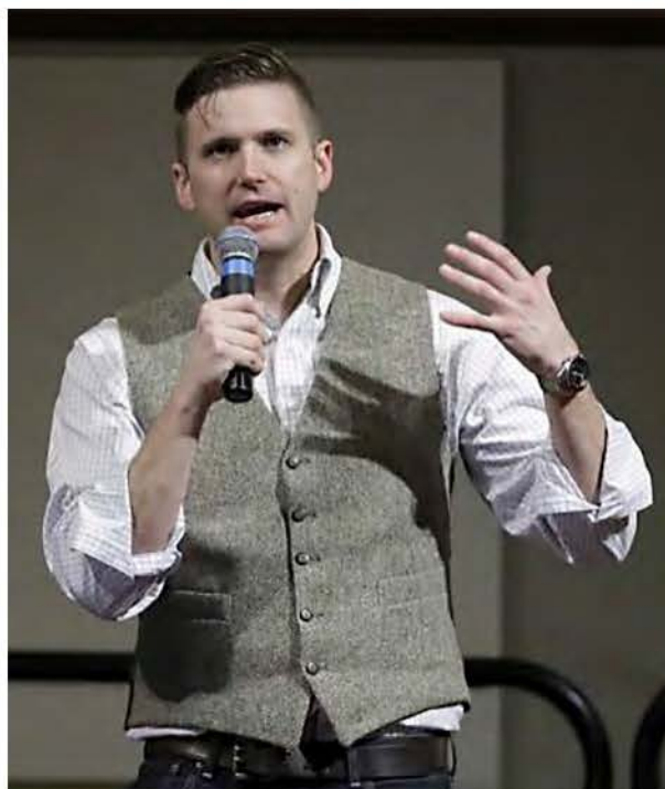
White Nationalist and Supremacist Richard Spencer