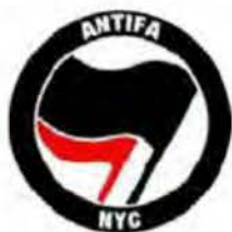
New York City