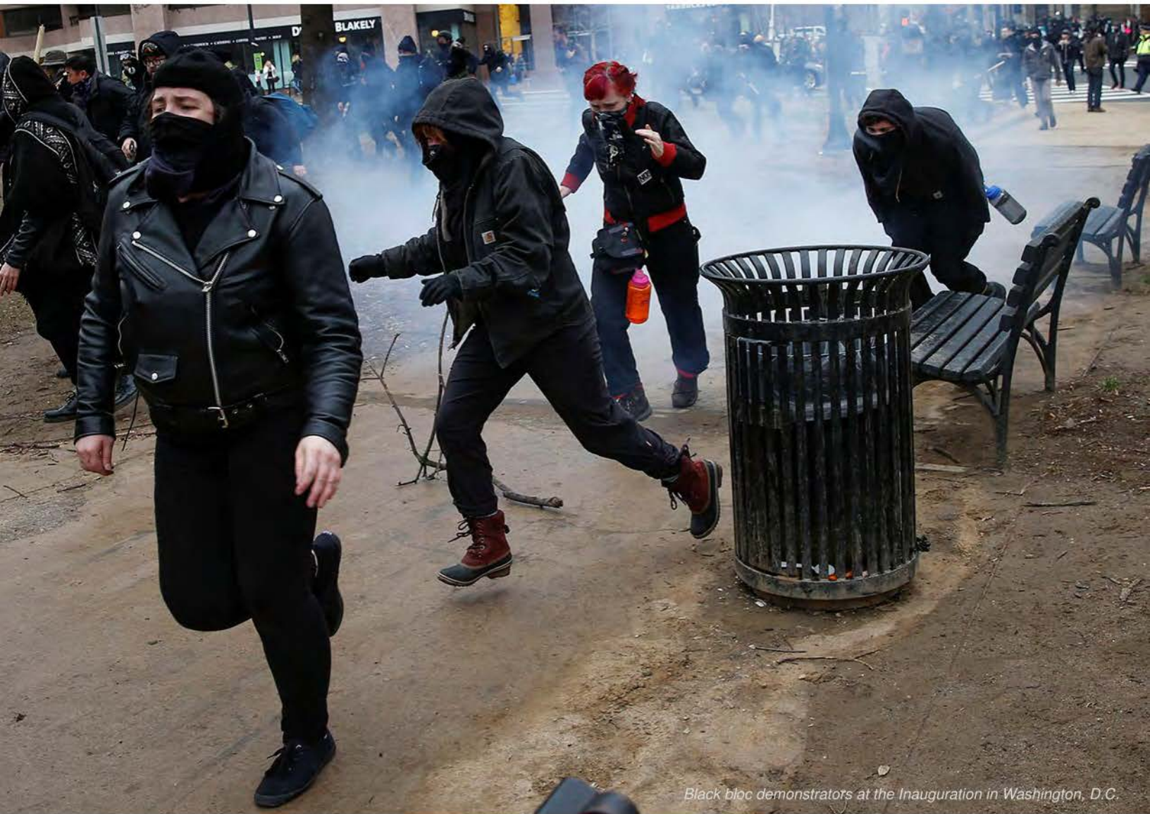
Black bloc demonstrators at the Inauguration in Washington, D.C.

of the basic tenets of Alt-Right politics is to label traditional conservatives as emasculated or effeminate. See page 9 for a detailed explanation of Alt-Right groups.