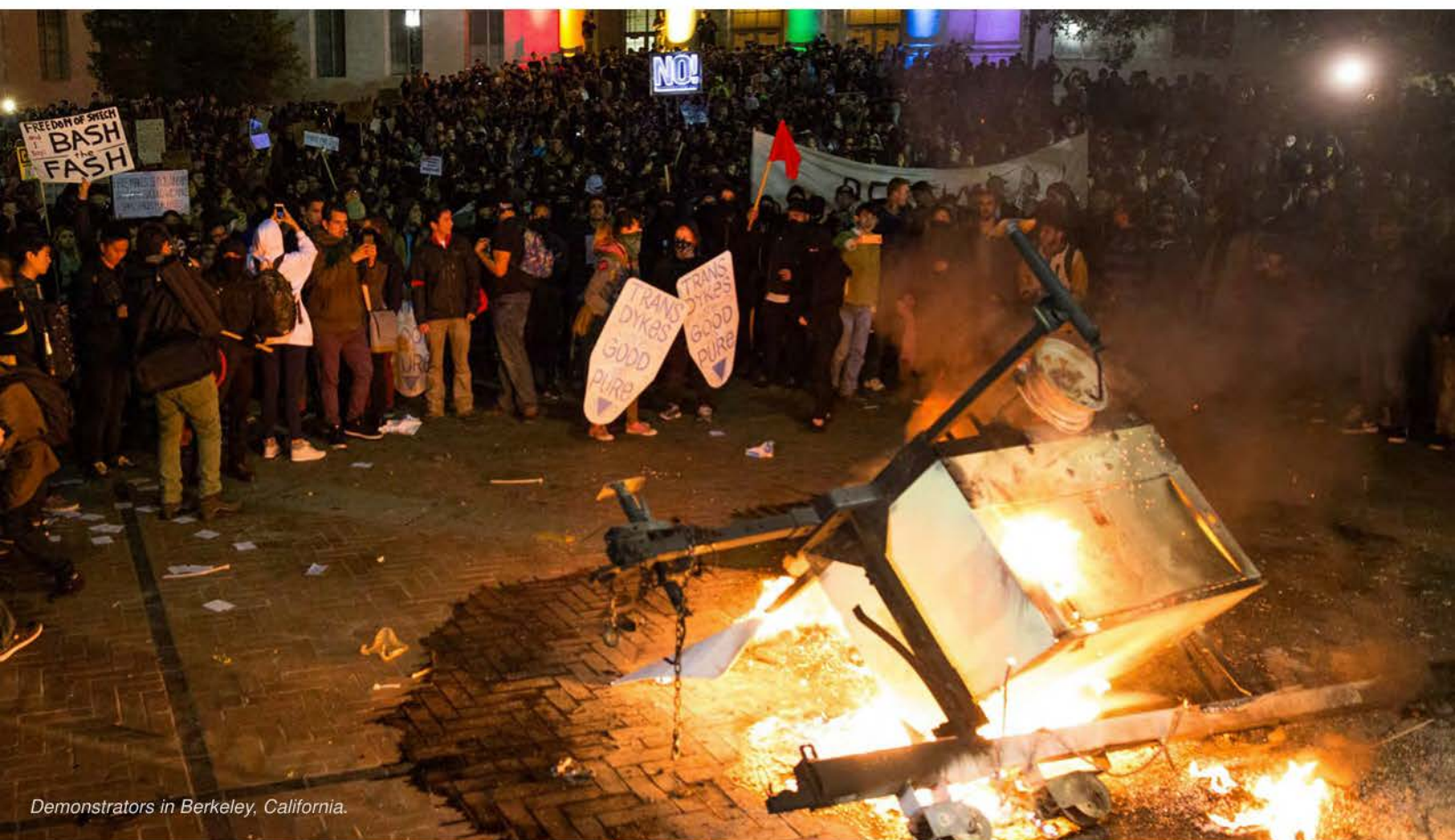
Demonstrators in Berkeley, California.

forms — sexism, racism, homophobia, government corruption, and Islamophobia.