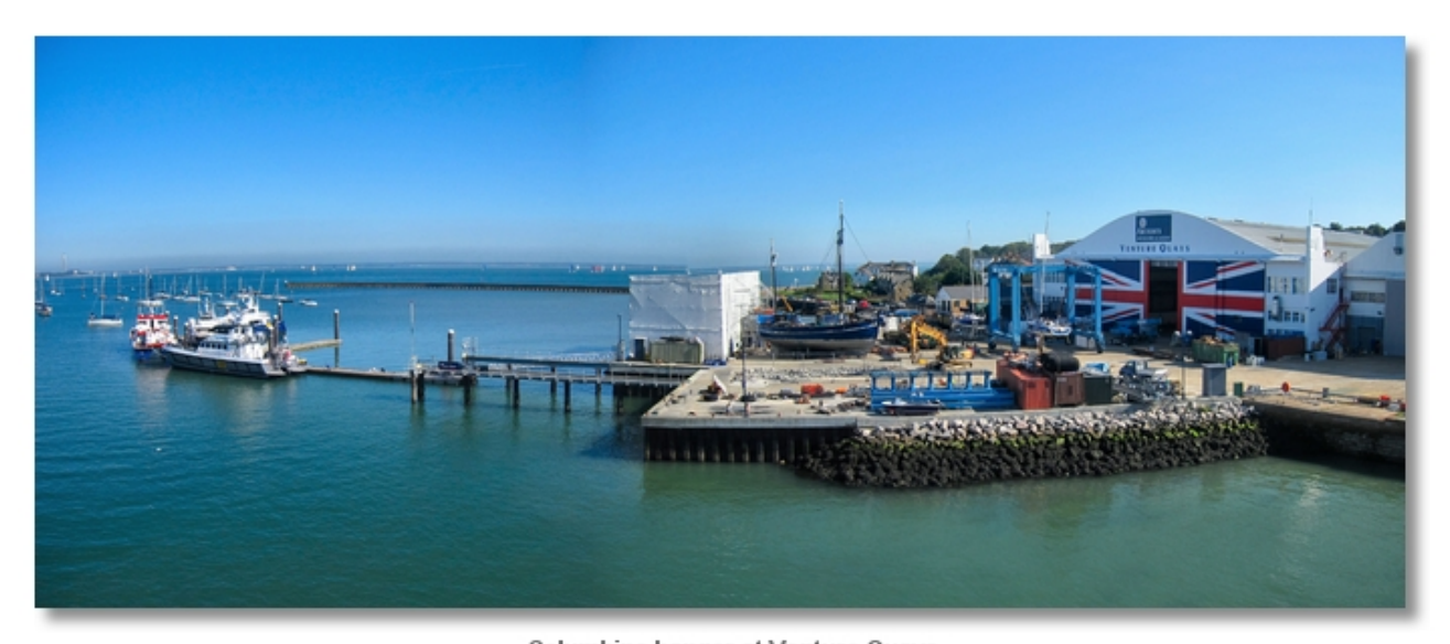
Columbine hanger at Venture Quays

The Columbine Shed was built in 1935 by Saunders Roe who manufactured sea planes. The site, having been redundant since the end of 2002, was sold to the South East England Development Agency by GKN Aerospace in 2004. The Union Jack, said to be the largest in the world, was painted in 1977 to celebrate the Queen's silver jubilee.