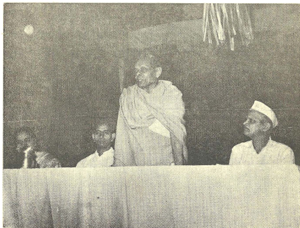
Ex. 27E: (Ketkar speaking) [See para 20.81]