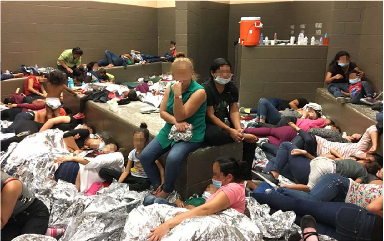
Figure 3. Overcrowding of families observed by OIG on June 11, 2019, at Border Patrol's Weslaco, TX, Station.

In addition to the overcrowding we observed, Border Patrol's custody data indicates that 826 (31 percent) of the 2,669 children 6 at these facilities had been held longer than the 72 hours generally permitted under the TEDS standards and the Flores Agreement. 7 For example, of the 1,031 UACs held at the Centralized Processing Center in McAllen, TX, 806 had already been processed and were awaiting transfer to HHS custody. Of the 806 that were already processed, 165 had been in custody longer than a week.