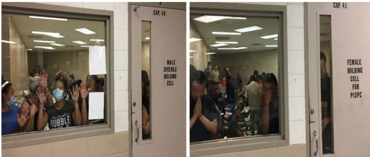
Figure 5. Fifty-one adult females held in a cell designated for male juveniles with a capacity for 40 (left), and 71 adult males held in a cell designated for adult females with a capacity for 41 (right), observed by OIG on June 12, 2019, at Border Patrol's Fort Brown Station.

We are concerned that overcrowding and prolonged detention represent an immediate risk to the health and safety of DHS agents and officers, and to those detained. At the time of our visits, Border Patrol management told us there had already been security incidents among adult males at multiple facilities. These included detainees clogging toilets with Mylar blankets and socks in order to be released from their cells during maintenance. At one facility, detainees who had been moved from their cell