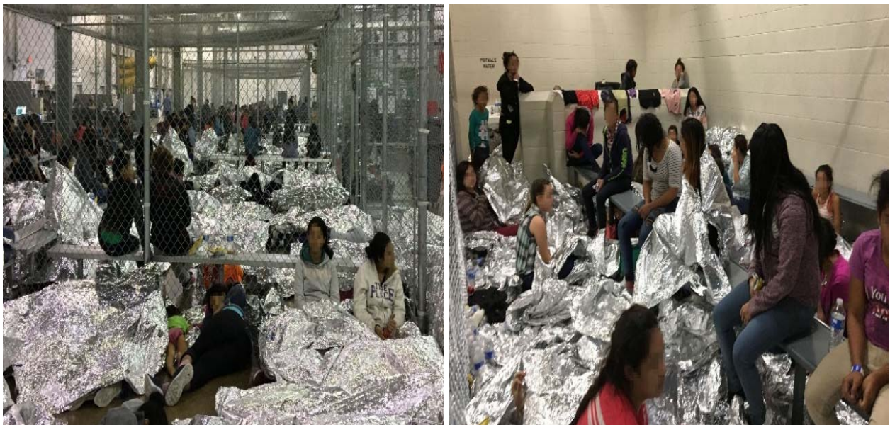
Figure 2. Overcrowding of families observed by OIG on June 11, 2019, at Border Patrol's McAllen, TX, Centralized Processing Center.