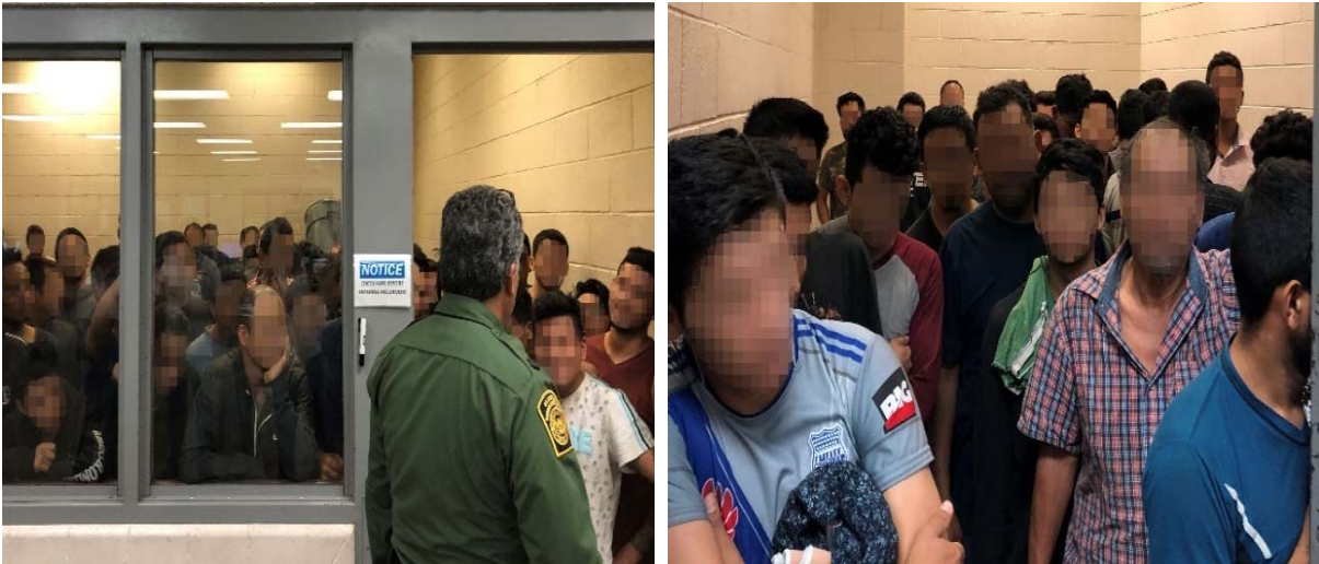
Figure 4. Standing room only for adult males observed by OIG on June 10, 2019, at Border Patrol's McAllen, TX, Station.