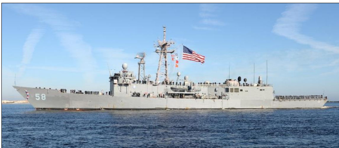
Figure 1. Oliver Hazard Perry (FFG-7) Class Frigate