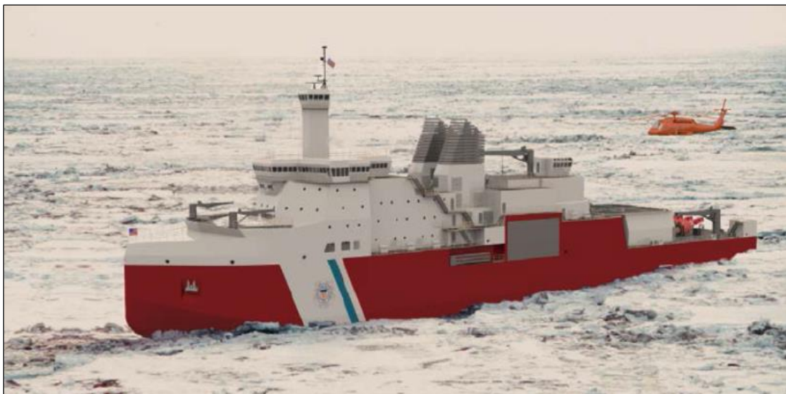
Figure 3. Rendering of VT Halter Design for PSC