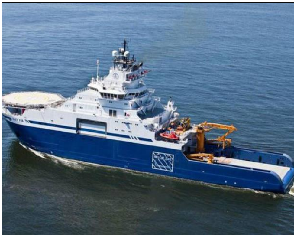
Figure 5. Aiviq