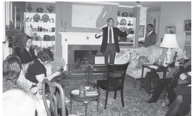
A lot of effort was made over the past few months to “spread the word” about Integral Group’s new plans for the GM site, including a Town Hall, demolition ceremony and inhome presentations.