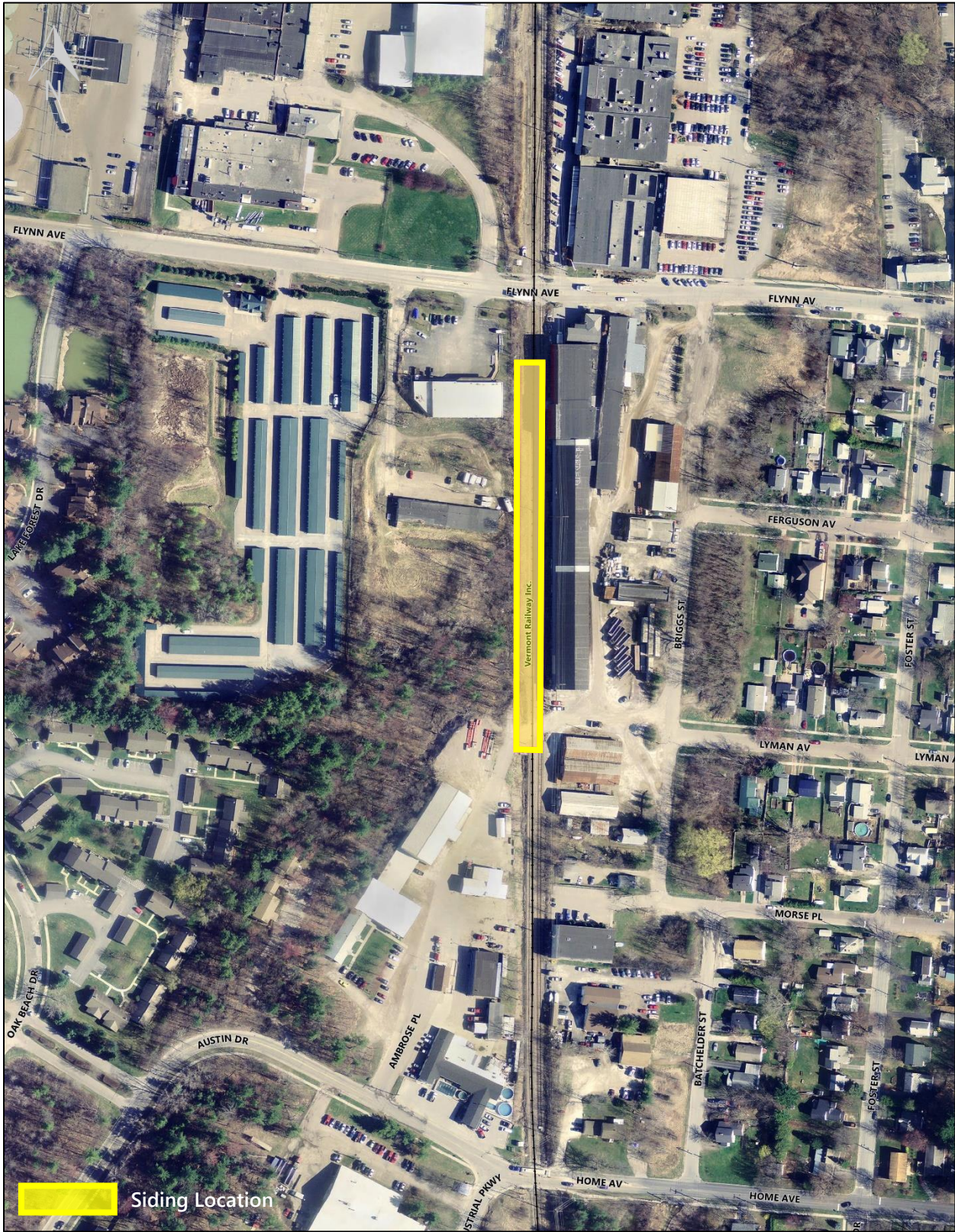
Figure 11: Flynn Avenue / Briggs Street Site