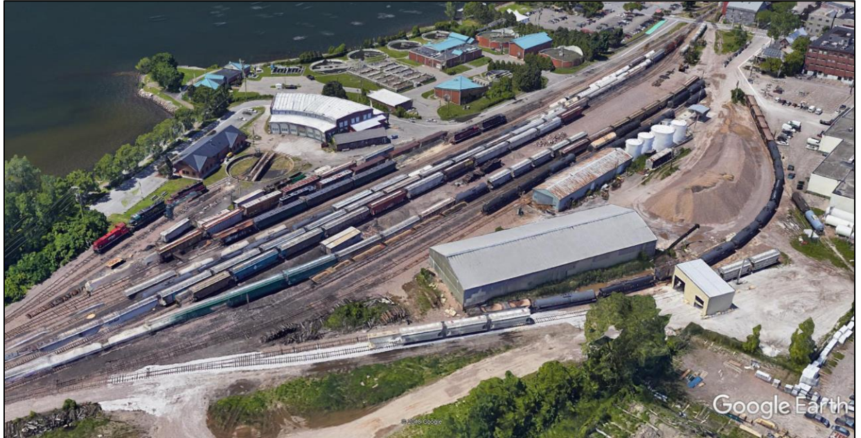
Figure 8: VTR Railyard Site Aerial View

The State of Vermont owns the railyard property and leases the land to VTR for railyard operations. VTR has reported that overnight storage of the Amtrak train within the railyard would significantly interfere with daily operations and would overload the yard which is currently operating at capacity. The railyard is often used for loading, unloading, and building trains and the Amtrak train would likely disrupt these operations by occupying a rail line required for train maneuvering overnight. Discussions with VTR and research of similarly-sized railyard relocation projects have indicated that in order for the Amtrak Ethan Allen Express train to be stored in the railyard, a full relocation of the railyard operations may be necessary which could cost upwards of $50,000,000. A study of the railyard relocation in 2000 concluded that a relocation could cost between $30,000,000 and $50,000,000 in 1999 dollars 1 , not including engineering and design, land acquisition, and environmental mitigation.