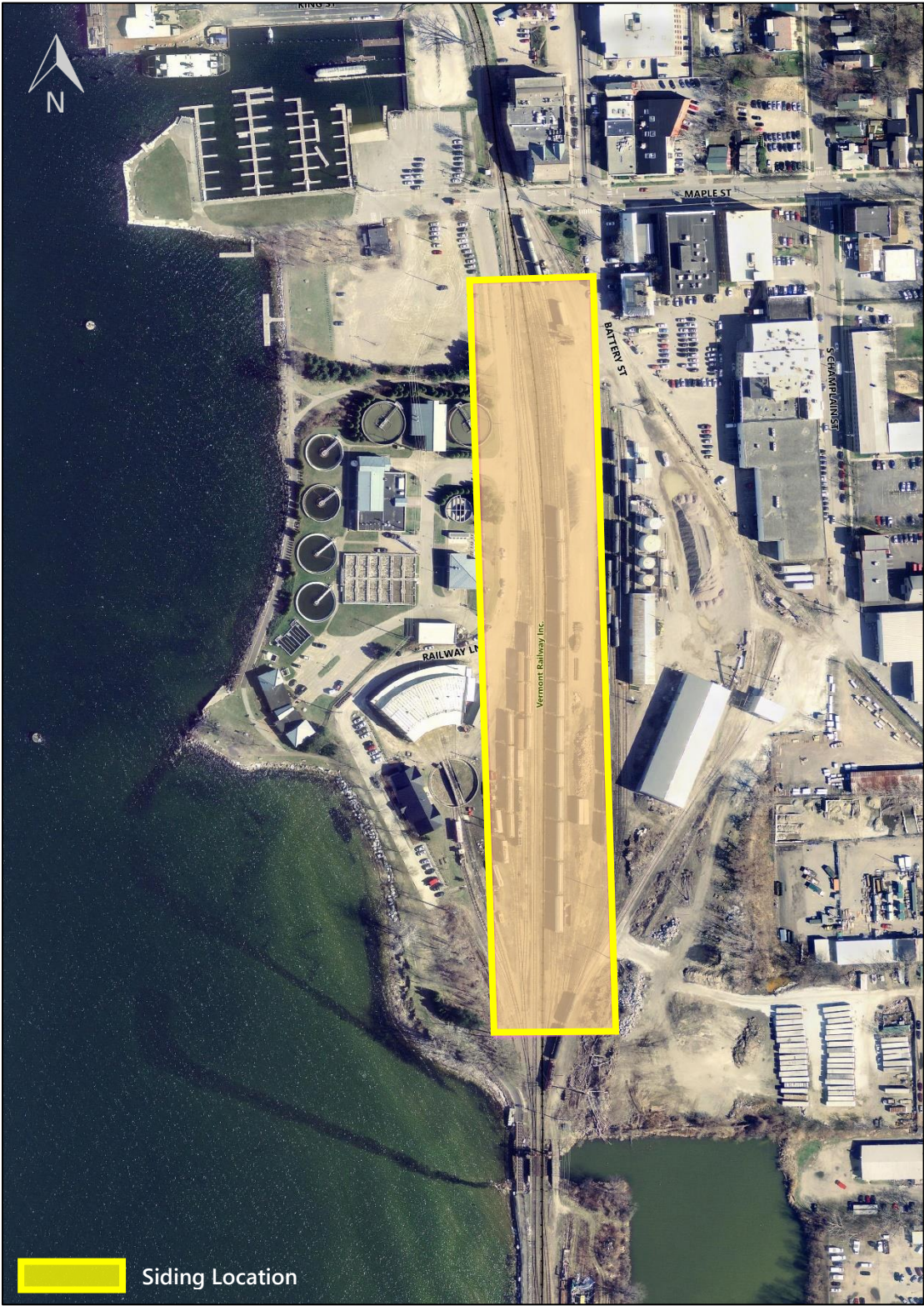
Figure 9: VTR Railyard Site