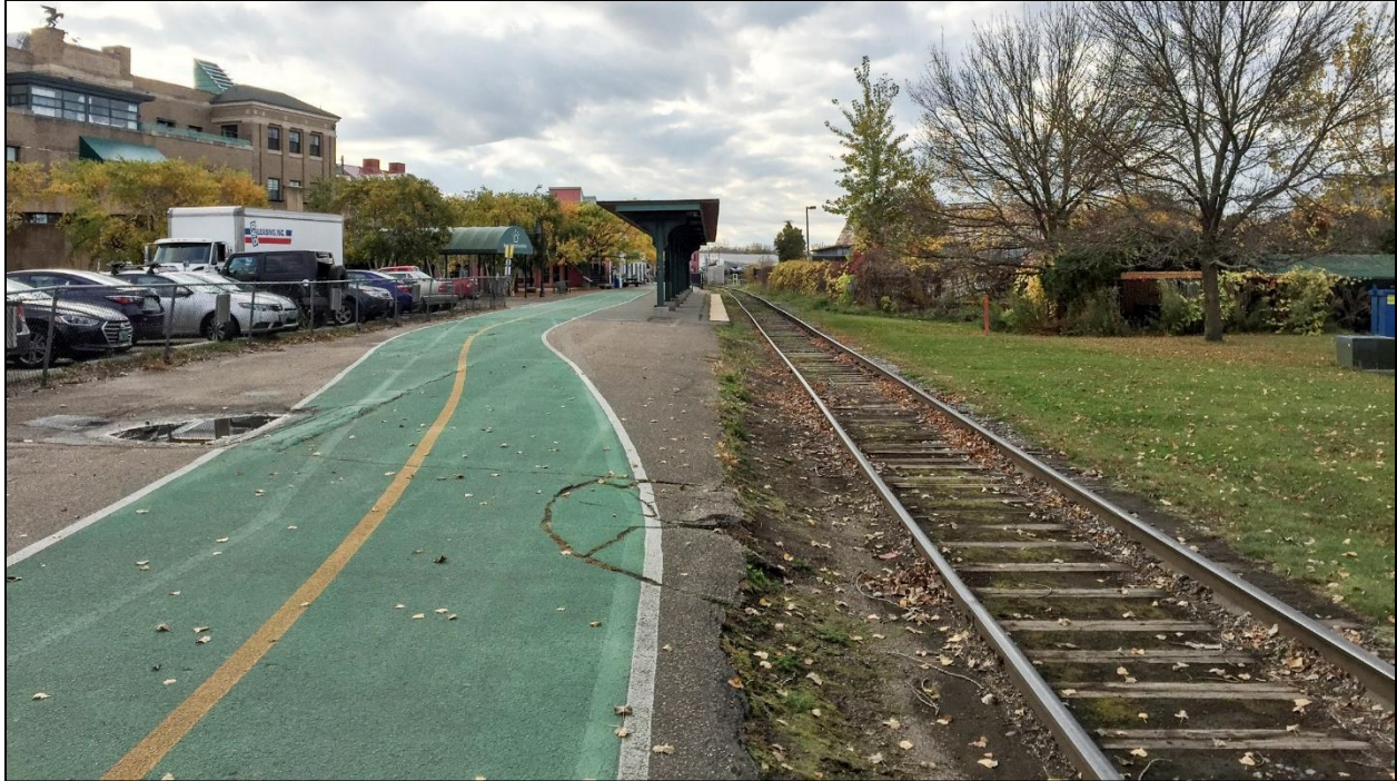
Figure 6: Union Station Site (Looking South)

This site currently has access to most necessary utilities as well as vehicular access. As noted above, a siding is currently planned to be constructed in this location, so no additional rail infrastructure would be needed. A three-phase power connection would need to be constructed and the associated costs for that improvement totals approximately $300,000.