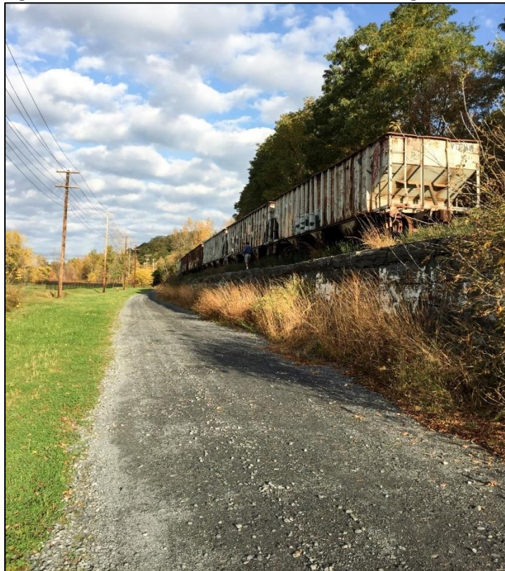
Figure 4: Southern Urban Reserve Site (Looking North)

To service and store the train at this location, 700-feet of new rail siding and retaining wall, a new switch, 200-feet of additional (double) track north of College Street, approximately 500-feet of new access roadway, and new rail crossing signals and flashers at Penny Lane would have to be constructed. This construction would require earthwork to ensure that the roadway and track would be located at the same grade. A three-phase power drop would be needed to provide access from the existing power lines in the vicinity. The construction of this track, roadway, and related infrastructure is estimated to cost approximately $2,240,000 – see Appendix E for more information on estimated costs.