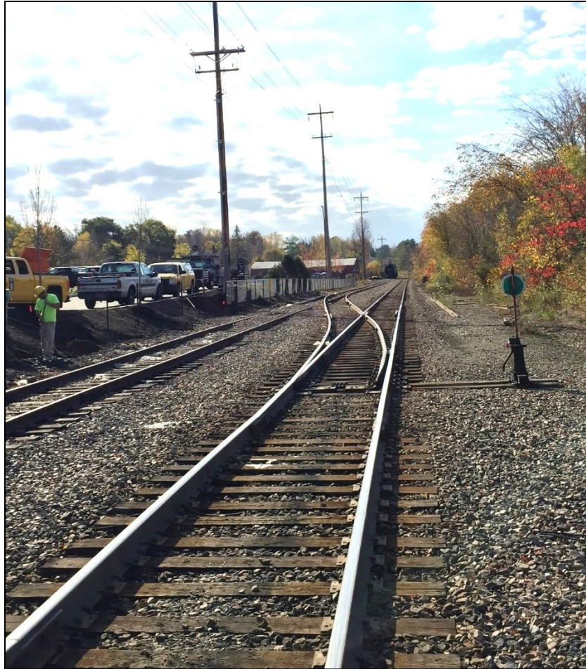
Figure 10: Flynn Avenue/Briggs Street Site (Looking South)

As with the Railyard site, if the Amtrak train were to be stored on this existing siding, VTR would need to construct equivalent rail car storage elsewhere in its system. Based on research and conversations with VTR, the cost of finding and constructing an equivalent rail siding is approximately $1,500,000.