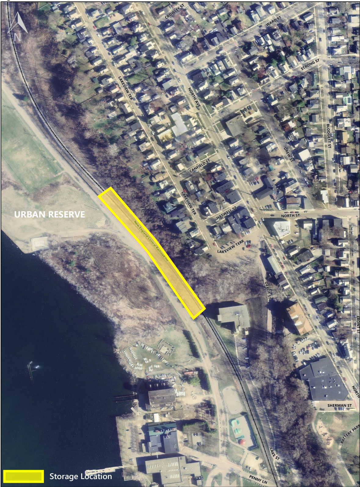
Figure 5: Southern Urban Reserve Site