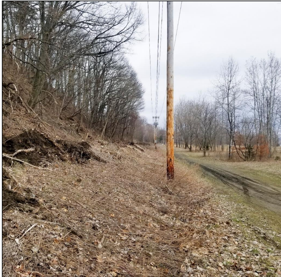
Figure 2: Northern Urban Reserve Site (Looking South)

To service and store the train at this location, 700-feet of new rail siding, a new switch, 200-feet of additional (double) track north of College Street, approximately 1,200-feet of new access roadway, and new rail crossing signals and flashers at Penny Lane would have to be constructed. This construction would require earthwork to ensure that the roadway and track would be located at the same grade. A three-phase power drop would be needed to provide access from the existing power lines in the vicinity. The construction of this track, roadway, and related infrastructure is estimated to cost approximately $2,290,000 – see Appendix E for more information on estimated costs.