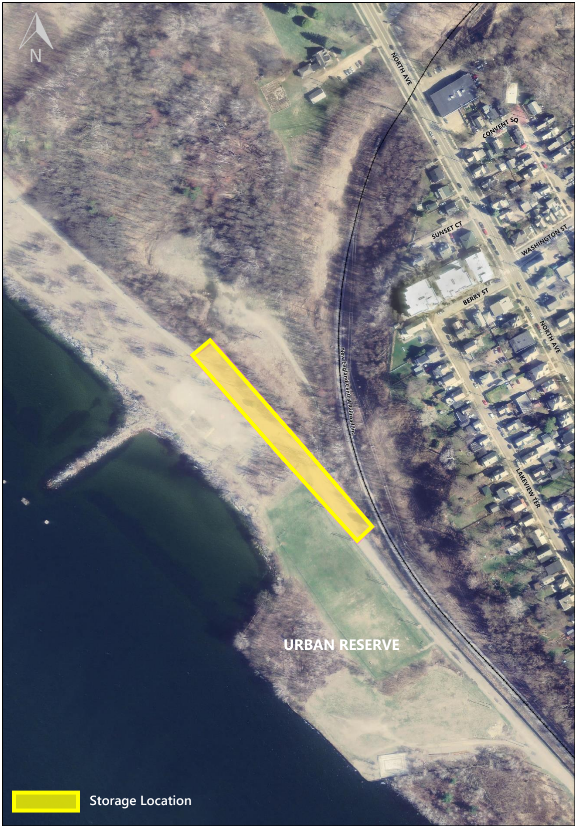
Figure 3: Northern Urban Reserve Site