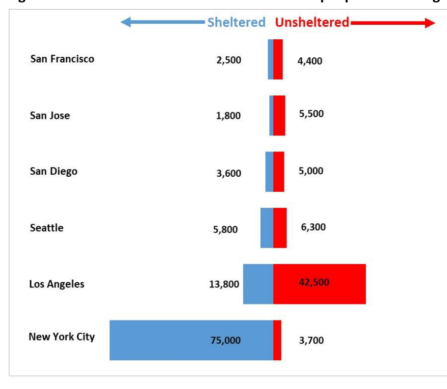
Figure 1: Numbers of sheltered and unsheltered people for the largest CoCs.

The Los Angeles Homeless Services Authority (LAHSA) estimated that 56,000 people experienced homelessness in 2019 during its point-in-time (PIT) count in the Los Angeles Continuum of Care (CoC)—36,000 of which resided within the City of Los Angeles (City).<sup>5,6</sup>