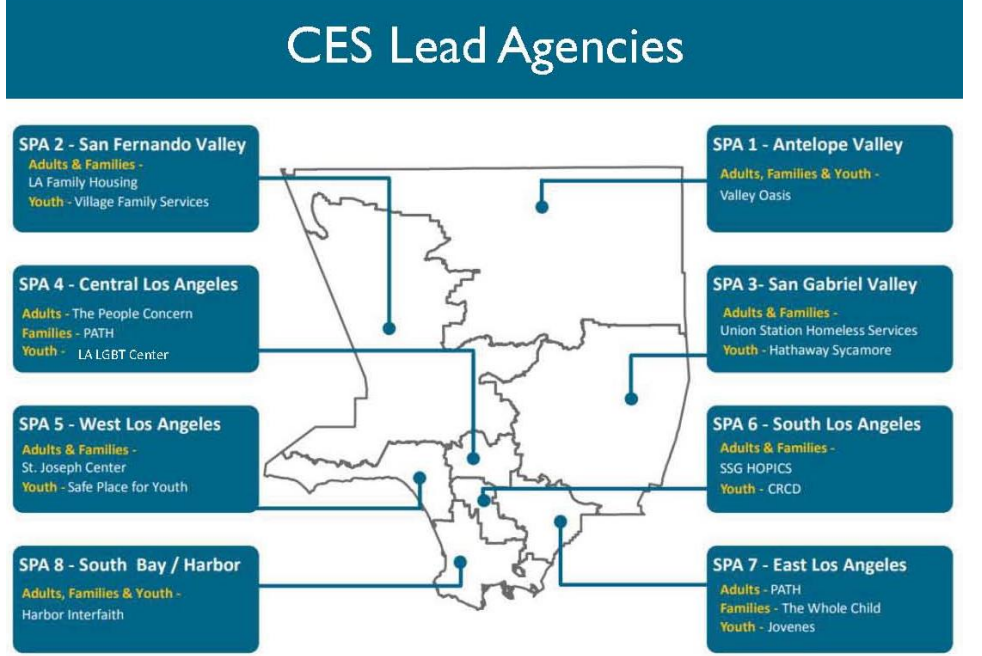
Figure 2: Coordinated Entry System Agencies

Among all of these duties, LAHSA also coordinates and performs outreach services to connect people experiencing homelessness to the appropriate organizations within each SPA.