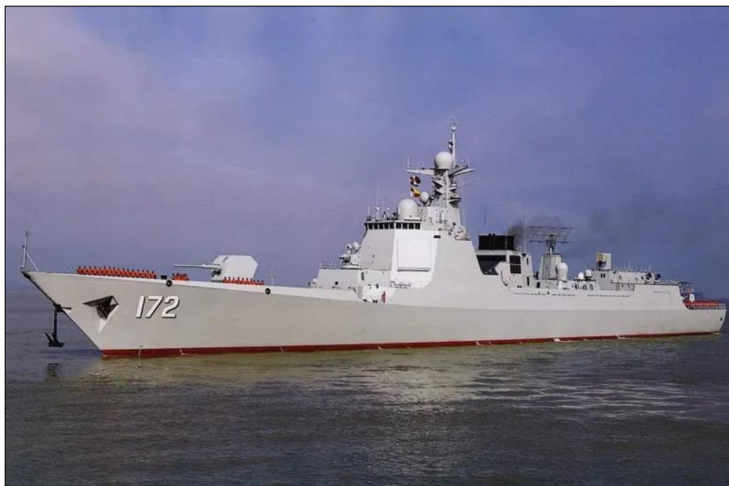
Figure 12. Luyang III (Type 052D) Destroyer