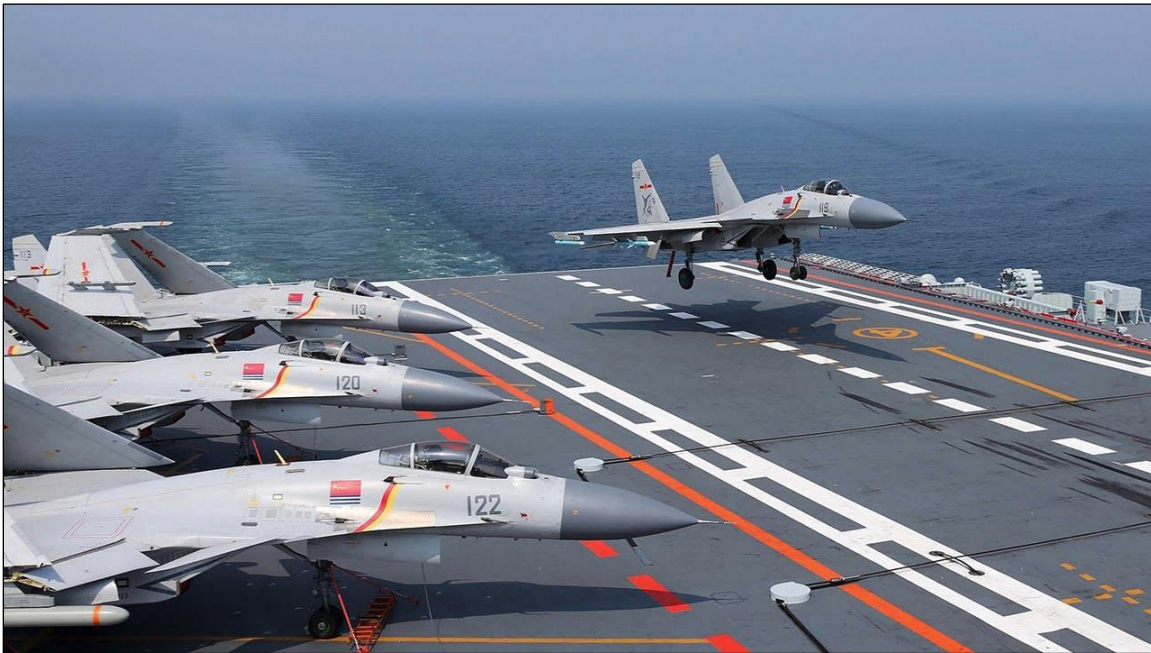
Figure 10. J-15 Flying Shark Carrier-Capable Fighter