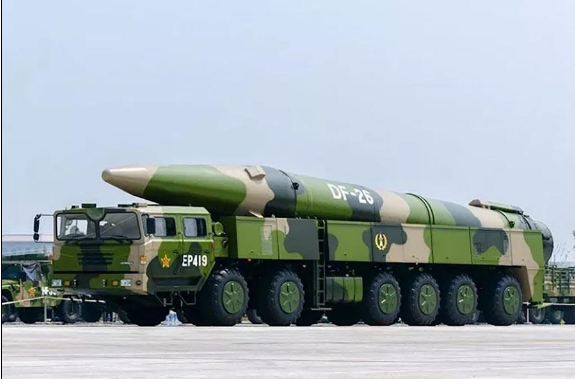
Figure 2. DF-26 Multi-Role Intermediate-Range Ballistic Missile (IRBM)