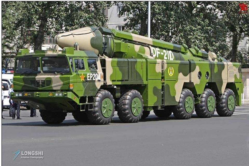
Figure 1. DF-21D Anti-Ship Ballistic Missile (ASBM)