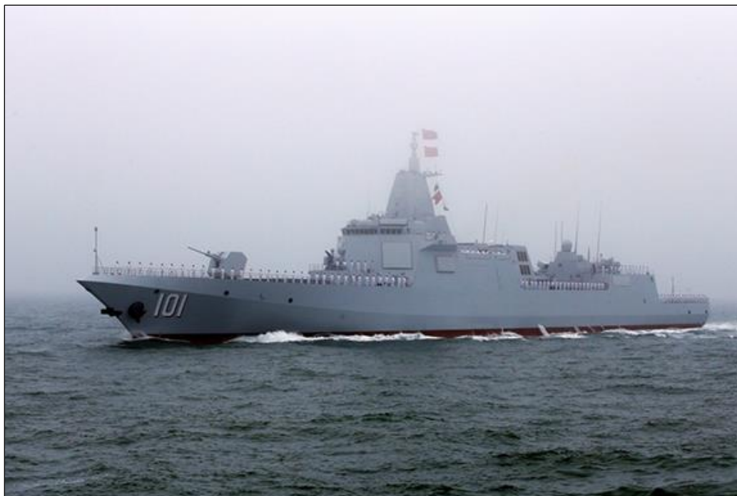
Figure 11. Renhai (Type 055) Cruiser (or Large Destroyer)