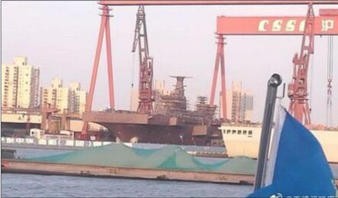
Figure 16. Type 075 Amphibious Assault Ship Under Construction