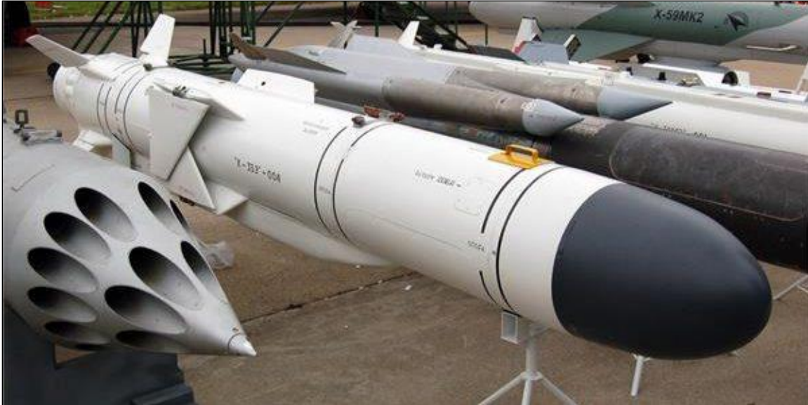
Figure 3. YJ-18 Anti-Ship Cruise Missile (ASCM)