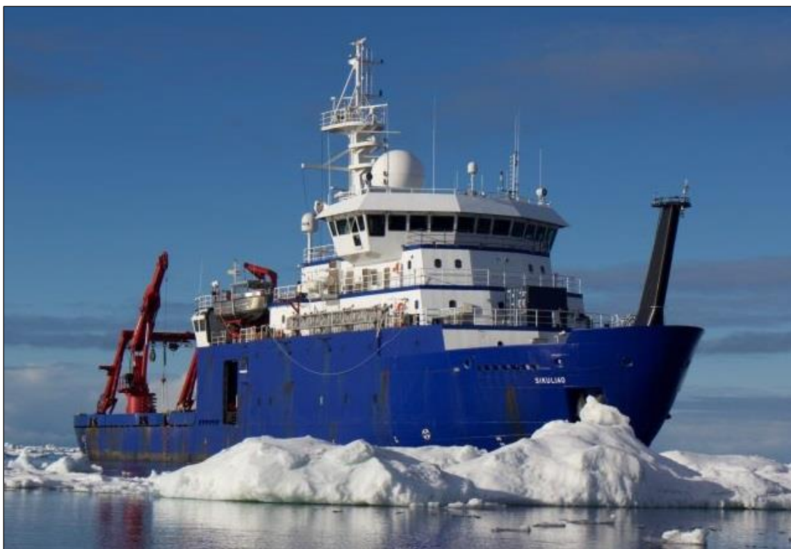
Figure A-6. Sikuliaq